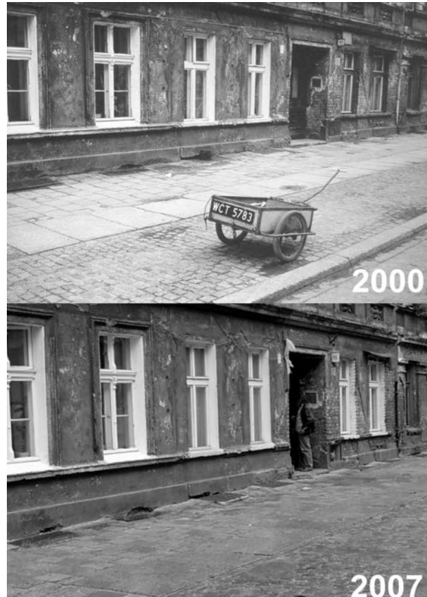
Fig. 2. Persisting problem of Wrocław: pre-war residential areas. Sępa-Szarzyńskiego Street

The problem of traffic jams is quite a new issue in Wrocław. Its appearance in the opinion of respondents reflects the dynamic development of car transport in the recent years. Wrocław is often perceived as the most congested city in Poland, though such a statement is not entirely true. An experiment conducted by the journalists of “Gazeta Wyborcza” in 2008 shows that the average speed of a car driving in the rush hour from the Wrocław