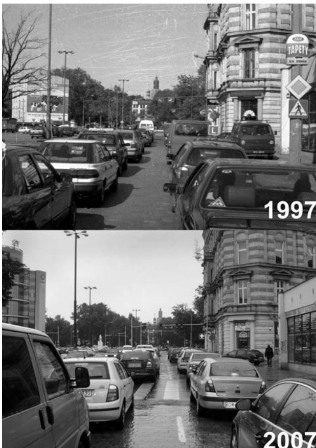
Fig. 1. Persisting problem of Wrocław: transport. Tęczowa Street

Il. 2. Stały problem Wrocławia: przedwojenne kamienice. Ulica Sępa-Szarzyńskiego