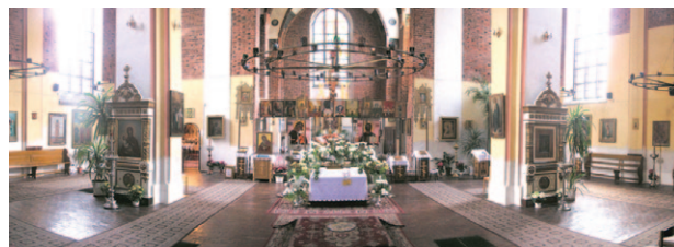
Fig. 5. Interior of the Orthodox cathedral of the Birth of the Mother of God in Wrocław – present view

Today’s Orthodox cathedral church is geographically oriented with three naves – with presbytery facing east – hall from the 14 th and 15 th century, two vaulted spans and a single-nave, simple enclosed choir and the vestry from north-east. Form the west there are two towers with square cross sections and one additional span between them to lengthen the nave and a vestibule adjoining the span. The dimensions of the church are 32.70 × 24.60 m. The irregularity of the plan (Fig. 3a) and space probably result from a lengthy construction process, however, among many different theological opinions on the build-