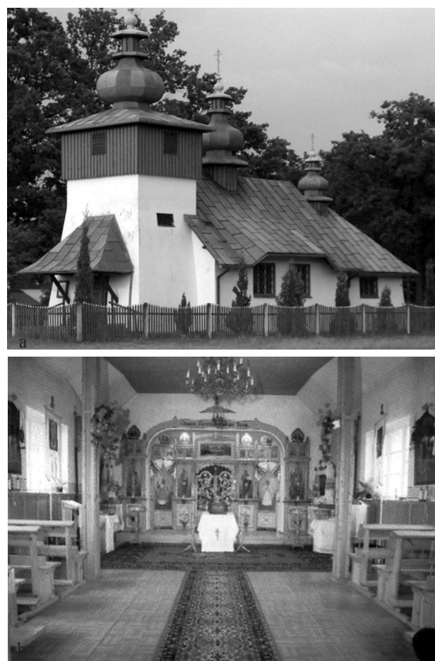
Fig. 7. Orthodox church of St. Archangel Michael in Michałów: view from outside (a) and interior (b)

In 1987, the believers from Michałów decided to construct a new church. The idea was not new – already in the 1970s the caretaker of the church began to collect build-