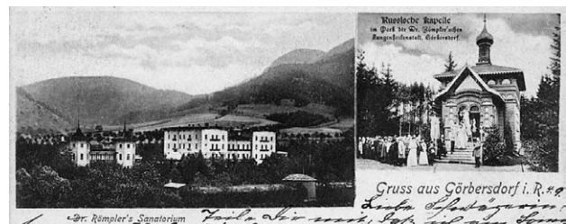
Fig. 1. Dr. Røempler sanatorium with the Orthodox church; postcard from 1899 [7]

After the war, as a result of territorial changes and resettlements, the territorial structure of the Orthodox Church in Poland changed. The Autocephalous Church of Poland (PAKP) suffered severe losses. It is estimated that about 90% of its possessions from 1938 was lost. What remained out of 4 million believers in Poland was about 300 thousand believers, one whole diocese and remnants of another, one monastery and 223 Orthodox churches – mainly in the east of Poland. The Orthodox education as