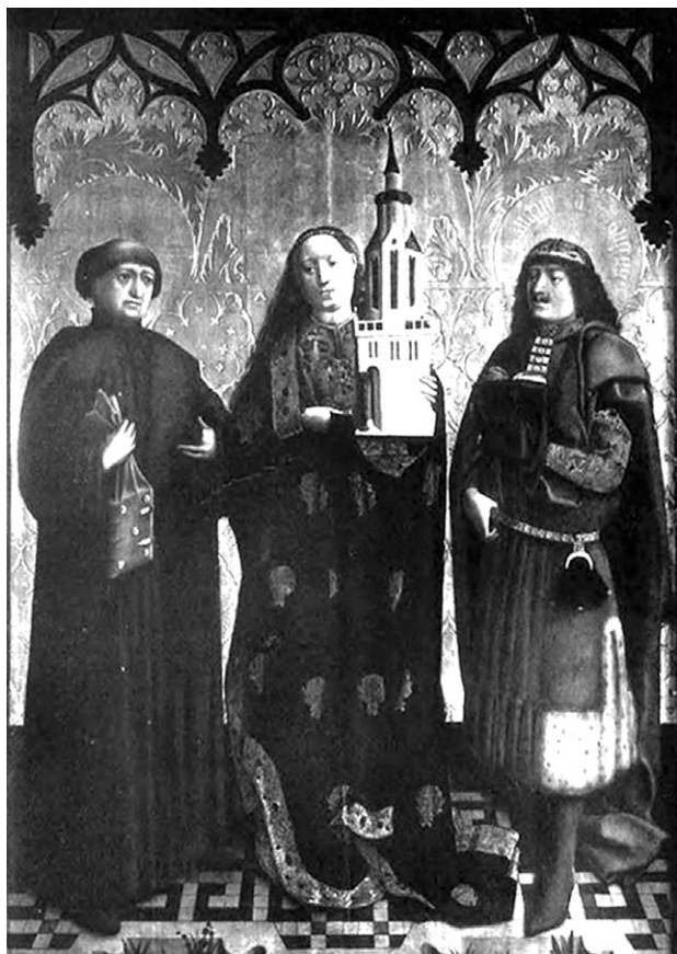
Fig. 4. Middle section of the altar from St. Barbara church (from the archives of the Orthodox cathedral parish in Wrocław)

Il. 4. Część środkowa ołtarza z kościoła św. Barbary (z archiwum prawosławnej parafii katedralnej we Wrocławiu)