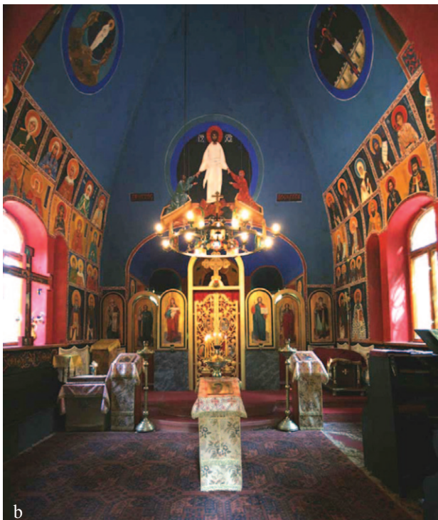
Fig. 6. Orthodox church of Archangel Michael in Sokolowsko at present: view from outside (a) and interior (b)

Il. 6. Cerkiew pw. archanioła Michała w Sokolowsku obecnie: widok zewnętrzny (a) i wnętrze (b)