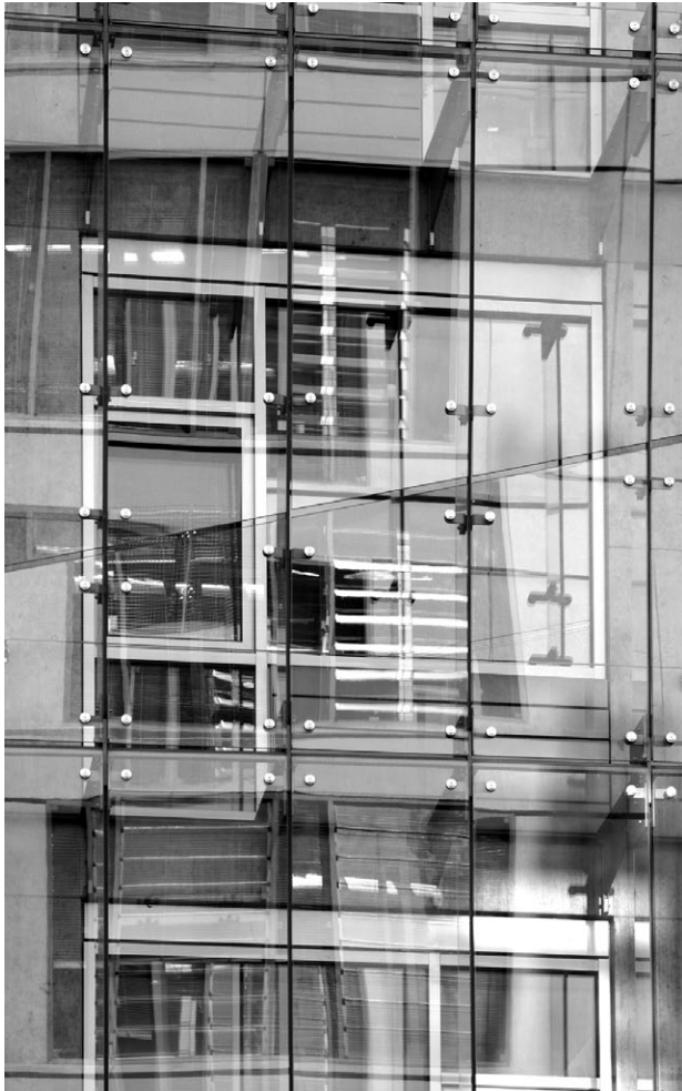
Fig. 3. Jakob-Kaiser-Haus in Berlin, arch. de Architekten Cie, Pi de Bruijn, 2002

Il. 3. Jakob-Kaiser-Haus w Berlinie, proj. de Architekten Cie, Pi de Bruijn, 2002