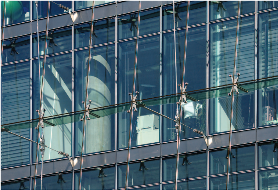
Fig. 5. Sony Center, arch. Murphy & Jahn Architects, 2000

Il. 5. Sony Center, proj. Murphy & Jahn Architects, 2000