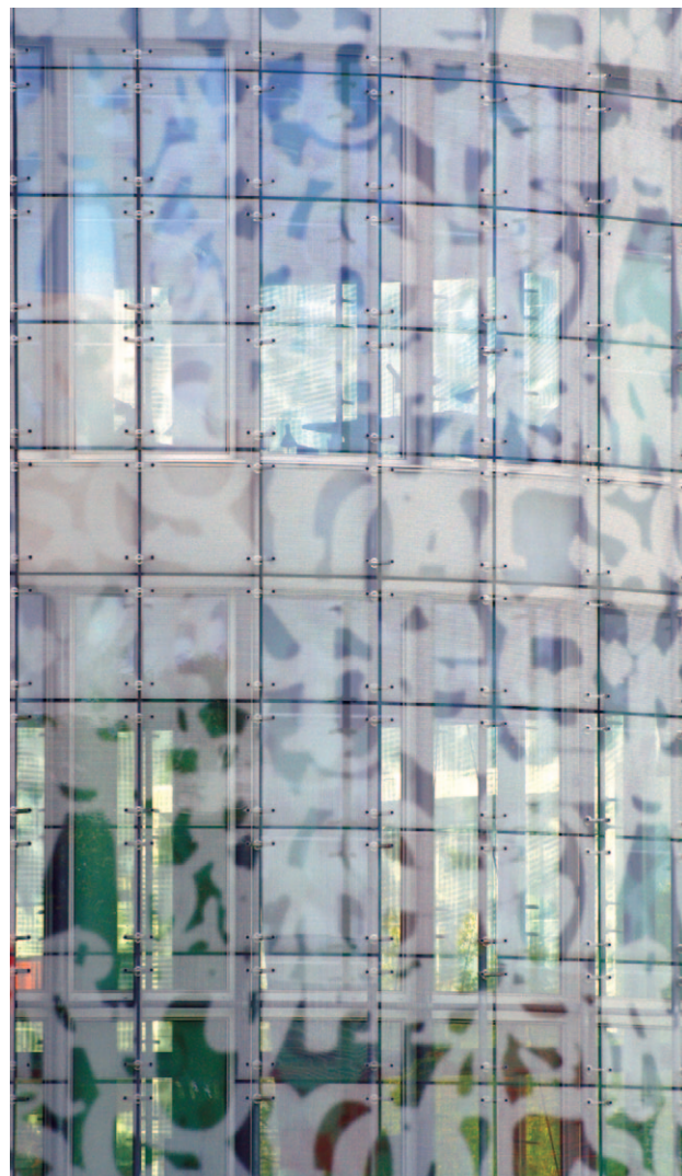
Fig. 6. IKMZ – Technical Library of Cottbus, Brandenburg Technical University, arch. Herzog & de Meuron, 2004

According to Herbert Muschamp: [...] what links [...] projects, apart from their transparent and translucent skins, is that the building’s skin is used not to reveal but to veil [10, p. 43]. Glazing no longer performs a classic function of the modernistic curtain wall. New semi-opaque and translucent façades deceive the eye, and produce a magical effect of a curtain. Application of many layers of translucent and semi-opaque materials leads to the formation of zones with different light transmission characteristics. These zones are not “flat”, but gain spatial depth contained between the layers of glass. A unique optical buffer is created, which is analogous to thermal and acoustic ones.