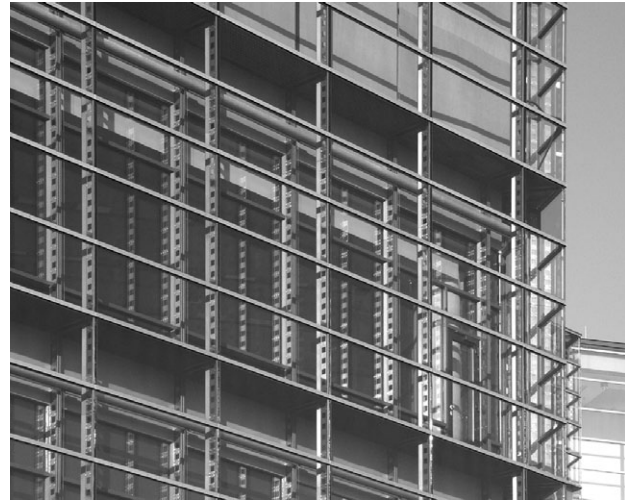
Fig. 4. CCN Ost Congress Centre, arch. S + P Heinz Seipel Ges. von Architekten mbH, 2006

A distinctive example of superimposition of fragmented virtual images is the German parliament office building Jakob-Kaiser Haus. Two segments of the south facing façade of block no. 5 and 6 were designed and constructed as a double layer façade: additional sheet of transparent glazing was placed in the front of standard office building wall with glazed windows. Due to the limited precision of the façade's execution, individual sheets of glass are not exactly in the same plane, so each pane reflects a different section of the building located at the opposite side of the street. Smallest shifts are easy detectible by the observer's eye because the juxtaposed building was equipped with rhythmic and orthogonal decoration. Regularly distributed windows and sun shades are fragmented and moved, almost "trembling". Two layers of glass make the phe-