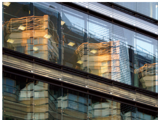
Fig. 2. Department store of the Galleries Lafayette in Berlin, arch. Jean Nouvel, 1995

Various configurations of transparent panes of glass lead to different formal and architectural appearances. Sometimes the effect of the imposition is almost picturesque, in other cases, even disturbing. Glass panes of the façade are never mounted exactly in one plane, so the reflections in individual sheets of glass are slightly shifted. This fragmentation of virtual image reminds of the cubist style, which is breaking the continuity of the presentation by the fragmentation of objects and visual integration of image is destroyed [8]. The designer is unable