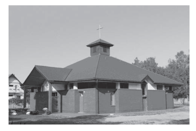
Fig. 9. Father Pio Church, Pniewy district, Bukowe housing estate, Szczecin