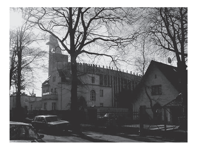
Fig. 1. Holy Cross Church, designed by architect Z. Abrachamowicz.

The church was built under the pretext of the development of the existing church which was situated in the prewar villa district and was one of the first realisations after World War II. The new church was based – as the central foundation - on the projection of a circle. The old church was built on the rectangle plan - it now performs the function of the chapel [2, p. 21]. The architectural composition of the new church, which was based on shaping the form by means of a pavilion roof based on a contrastively dif ferent structure of the external walls – integrated totally the forms of the old and new churches. The old church was frontally divided with the wall joined with the new structure and covered with one pavilion roof. Only after entering the courtyard can we see the original southern façade of the old church nave [2]. The external walls at the presbytery and opposite sides are built of columns and they are completely openwork filled with colourful stained-glass. The other walls are full (only with small