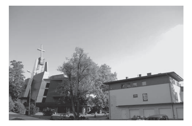
Fig. 2. View from Przyjaciół Żołnierza Street, Parsonage and Divine Mercy Church.