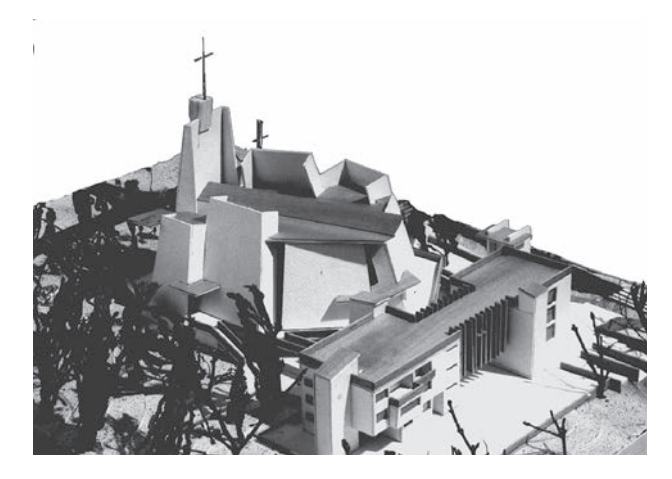
Fig. 3. Model – north-west view of the catechistic-office-residential complex, from collections of A. Szymski – design's author

planes connected with the chapel in the shape of a round 'tent'. The effect of installing the skylight in the ceiling gave southern light directed at the nave while the side skylights collect light from various sides [4, pp.467–471]. Colourful play of lights creates a unique, calm and atmosphere. The church blends in with high blocks of flats of the housing estate and dominates with its interesting architecture. The change from the original Resurrection of the Lord Church into Divine Mercy Church undoubtedly influenced the final appearance of the church structure. The initial concept of the building form was supposed to resemble a cracking rock massif which symbolised the act of resurrection. However, changes of parish priests and their new ideas regarding the final appearance of the structure as well as financial limitations resulted in changes of the original assumptions. In spite of this, a general structure of the church preserved its form. Działoszyński Travertine lining was supposed to be a façade material (with the final effect of golden colour patination) but it was replaced by a trapezoid sheet in red colour, which absolutely does not correspond with the nature of the structure.