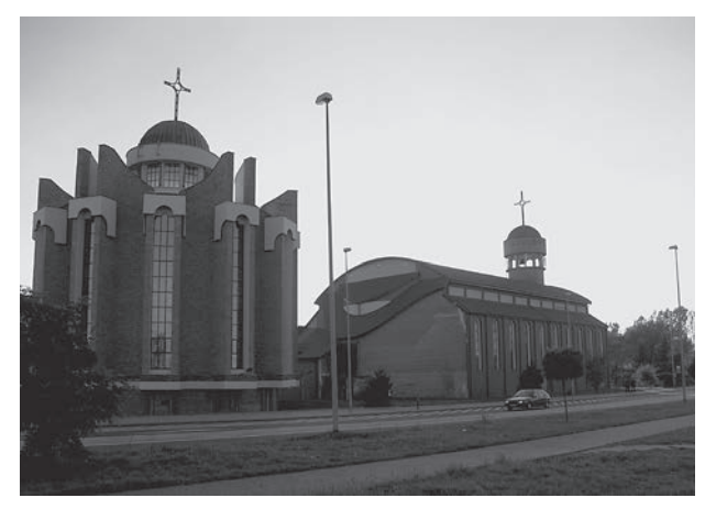
Fig. 6. Fatima Mother of Jesus Chapel and Immaculate Heart of Blessed Virgin Mary Church, Słoneczne housing estate, Szczecin.