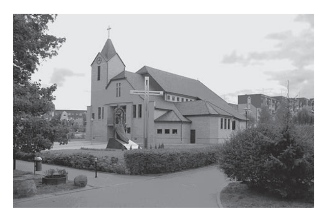
Fig. 8. Jesus Good Shepherd Church

One of the churches located in the territory of Western Pomerania: