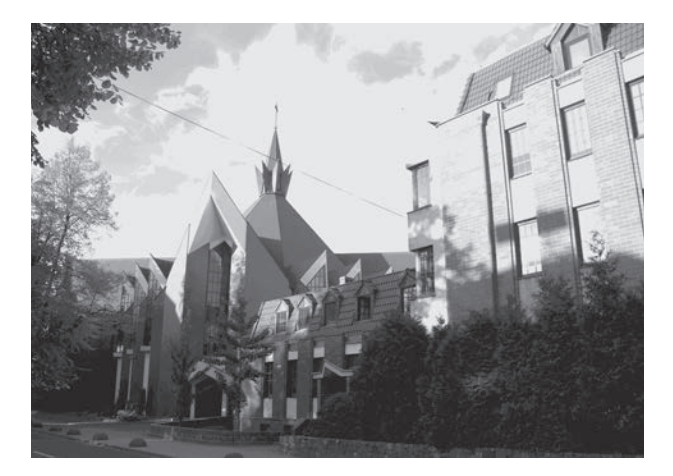
Fig. 4. Dominique Church of Dominican Fathers, Ofiar Katynia Square, Szczecin.

The complex of sacral development consists of a church and monastery building which belong to Dominican fathers. The church building, which was built on the Greek cross plan with a traditional orientation east west, is made of brick. A roof with a construction made of wood glued together and covered with copper constitutes a curiosity and rarity for the structures of this type in our times. In spite of changing the previous steel structure, the present structure blends with the church interior in a much better way. The façade was lined with clinker tiles in the tone which corresponded with the monastery building facades. The complex of buildings constitutes an inseparable whole - it creates a united formation with the surrounding residential buildings and has the same form. The whole complex, which was designed and built with relation to the historical tradition, was accepted by the investor who is going to realize the whole complex of sacral structures along with the interior [1, pp. 191–206].