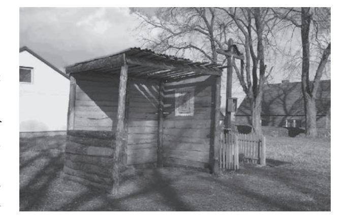
Fig. 10. Beginnings of the parish in Doluje, 2006, downloaded from: http://szczecin.kuria.pl/

The idea of building a sacral structure gives unlimited possibilities and the cross itself determines the character