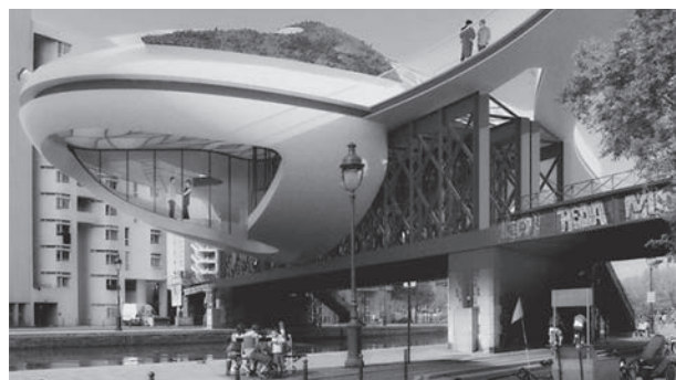
Fig. 4. Anti-Smog, Paris, Vincent Callebaut

Physalia is meant to navigate through the rivers and clean water. Furthermore, inside there will be lecture halls and gardens where the visitors will live pro-ecologically. Another design by Vincent Callebaut called Dragonfly is a vertical farm providing healthy and ecological food. The program includes the production of high quality vegetables and fruits. The futuristic ecological farm without pesticides will be located in the heart of New York. Anti-Smog is a project for one of industrial districts in Paris (see Fig. 4) [1]. A structure whose surface is coated in titanium dioxide will efficiently reduce the amount of