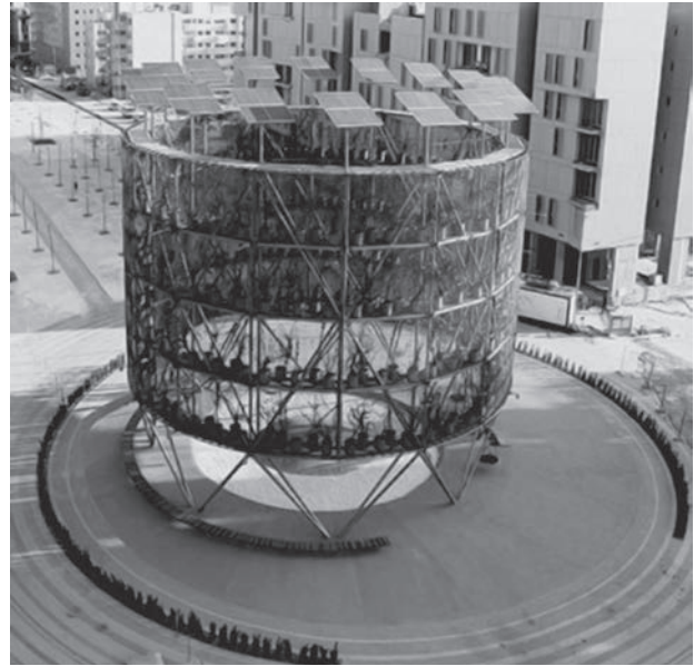
Fig. 5. Eco Boulevard, Ecosistema Urbano