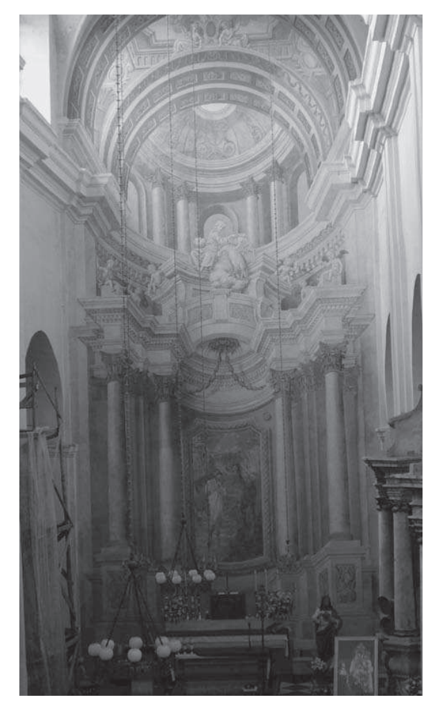
Fig. 10. Holszany, painting after conservationII. 10. Holszany, malowidło po konserwacji