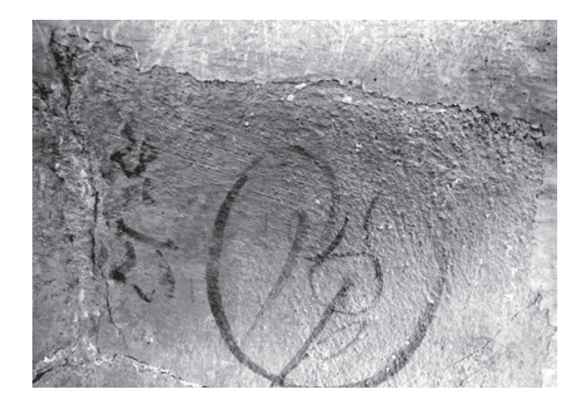
Fig. 7. Holszany, original signs with a pink cloud in the background pose an interesting riddle for researchers. It is possible that it is a form of signature and date (?)

II. 7. Holszany, znaki zachowane na tle różowej chmury stanowią interesującą zagadkę dla badaczy. Możliwe, że jest to forma sygnatury i data (?)