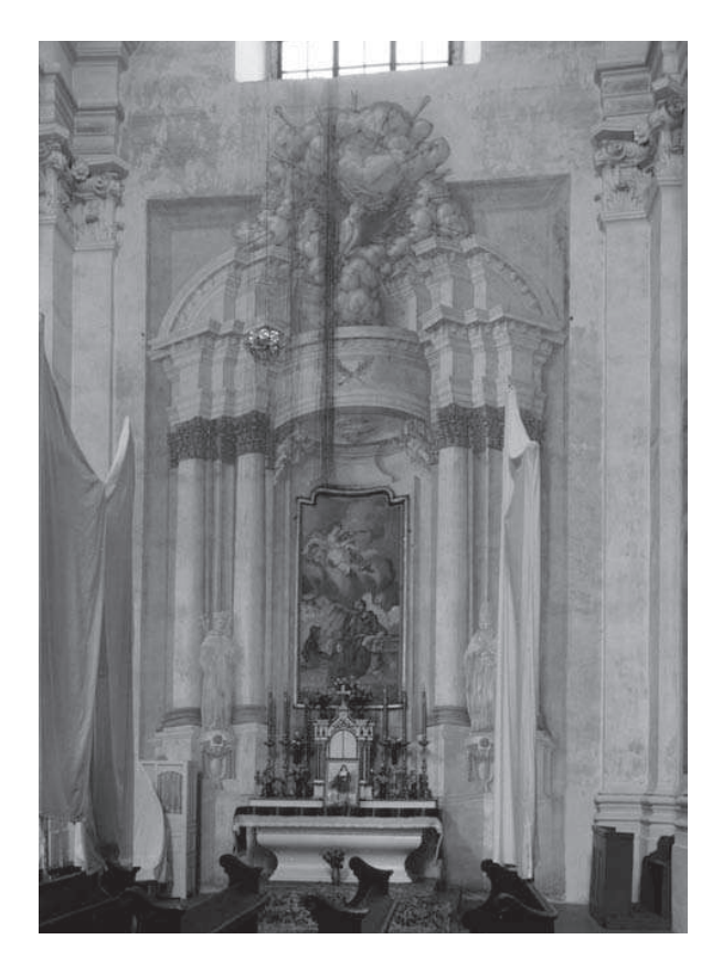
Fig. 4. Side altar of St. Francis in the church of Friars Minor in Budsław (photo: G. Trimakas, 1977) Il. 4. Boczny ołtarz św. Franciszka w kościele bernardyńskim w Budsławiu (fot. G. Trimakas, 1977)

The painted altars in the Grand Duchy of Lithuania were created by masters of different origin and class. Few original altars evidently show such differences. The main altar in the Church of St. John the Baptist and Evangelist in Holszany is a good example of "high art."