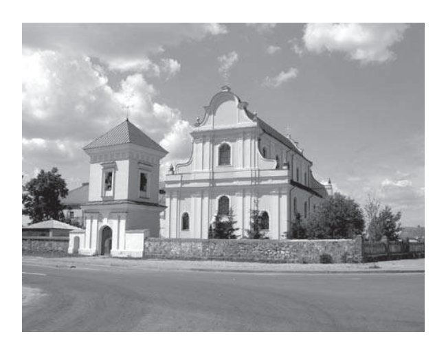
Fig. 1. Church in Holszany (photo: B. Wójtowicz, 2007) Il. 1. Kościół w Holszanach (fot. B. Wójtowicz, 2007)

In the 1930s, the Soviet authorities closed the church in Holszany and turned it, just like many other churches, into workshops. It was given back to the believers only in 1990, and at the very end of the 20<sup>th</sup> century, the Franciscan monks returned there too. However, they found the temple, which once was famous for its excellent pieces of sacred art, destroyed and devastated. There were no altar paintings, wooden pews, confessionals, Rococo ornaments, carved in wood figures of four Evangelists and St. John the Baptist that once decorated the pulpit, or the pulpit itself, which was earlier located by the side altar of St. Anthony. The wooden elements of its interior decoration were probably burned down by the workshop workers. The Belarusian muse-