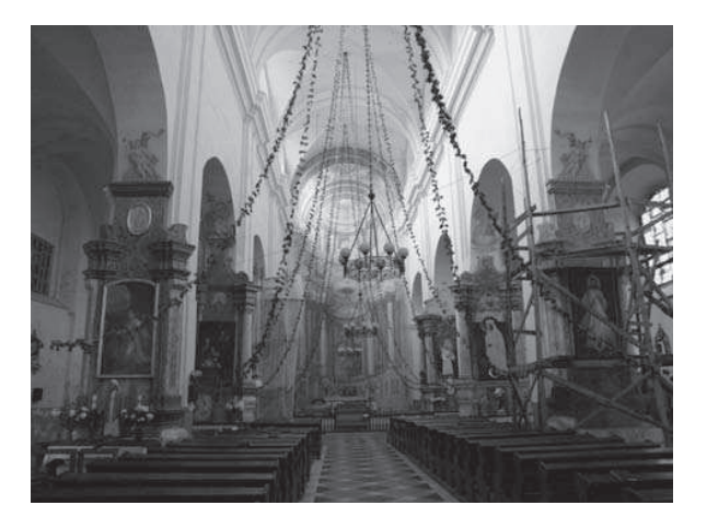
Fig. 2. Holszany interior of the church with side altars

Il. 2. Holszany, widok wnętrza kościoła z perspektywą ołtarzy bocznych