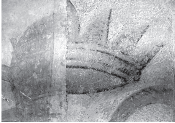
Fig. 8. Holszany, originally a crown was painted under the cartouche and then a pope's tiara and keys of St. Peter appeared in two successive layers

Some overpaint had to be removed with distilled water, and in the lower sections with the use of machines. Deeper cracks in the plaster were glued with hydraulic mortar PLM, and smaller flakings with acrylic emulsion Primal AC 33. In general, the condition of the substrate of the whole painting should be considered rather stable. Deeper lacunae and cracks were filled with lime and sand putties, whereas shallow ones were filled with whitewash.