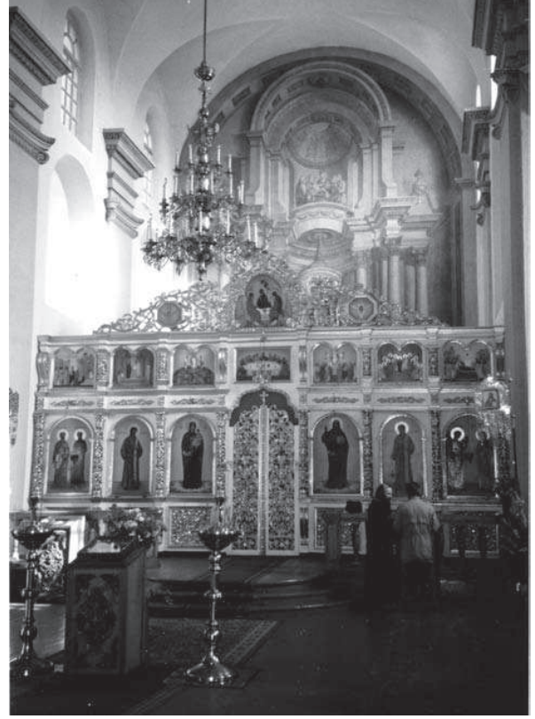
Fig. 5. Interior of the monastic orthodox church of the Basilians (currently eastern orthodox), Liady. Behind the iconostasis on the sanctuary wall, the upper section of painted altar

<sup>3</sup> Ołtarzow pobocznych przy Filarach umieszczonych Sześć, jako to: Szwiętey Anny, Sgo Antoniego z Sukienką na obrazie Srebrną, Sgo Jozefa z Kopertyna, Nayswiętszey Panny Niepokalanego Poczęcia, Swiętego Franciszka Serafickiego, Sgo Tadeusza z mensami murovanemi. Każda z nich o iednym Gradusię. Takowe Wszystkie Ołtarze Uniformem zdziałane naylepiey w Kolory falszmarmurowane, z róźną w gurze Sztukateryą; Całey tey Bazyliki iedyną staie się Osobliwością [23, 1. 109v].