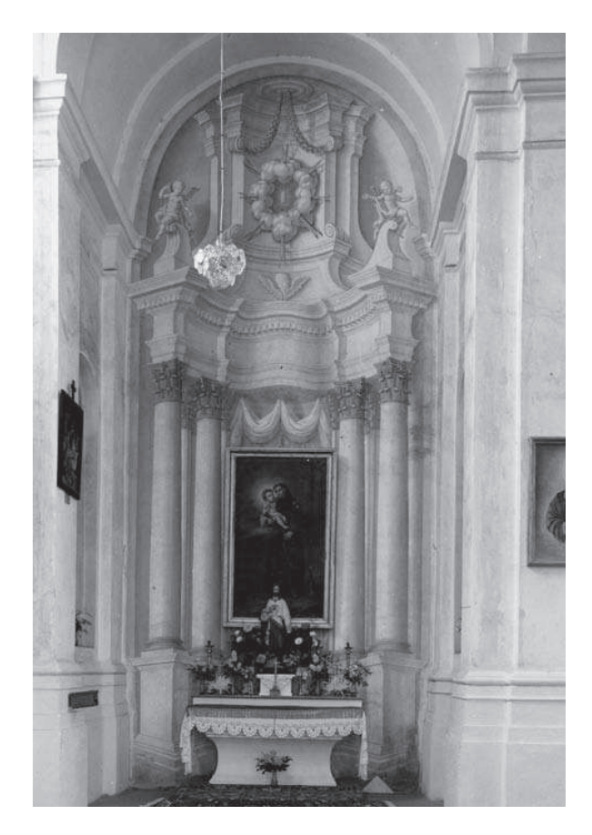
Fig. 3. Side altar of St. Anthony in the church of Friars Minor in Budsław

um employees saved the marble tomb monument of the founder of the Franciscan estates in Holszany – Paweł Stefan Sapieha and his two wives (Regina and Elżbieta) from total destruction. It was moved to the Museum of Early Belarusian Culture in Minsk. What remained of