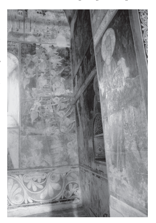
Fig. 3. Montenegro, Pivski Monastyr, fresco with the ladder of virtues on the north wall of the narthex