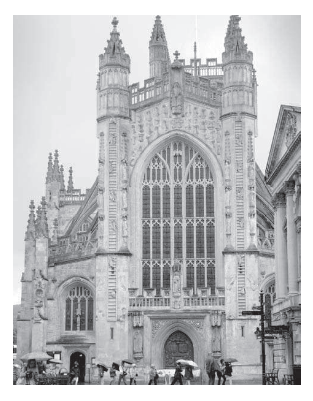
Fig. 1. Cathedral in Bath, west front II. 1. Katedra w Bath, elewacja zachodnia

tions in the ecclesiastical buildings included extensions, conversions, sometimes architectural style updates, preserving the earlier structural elements. In this case, however, it seems that Bishop King's foundation which used only the footings of the earlier cathedral's nave was much smaller. It can be assumed that in this case the point was to develop architecture which would fit the refined tastes of the elegant resort's clientele (Fig. 1). In 1500, Bishop King commissioned that task to two royal architects Robert and William Vertue [7, pp. 197–201]. They were famous for their boast, typical of Renaissance,