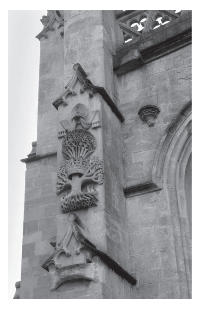
Fig. 6. Cathedral in Bath, west front, relief symbolizing Bishop Oliver King (photo: Z. Świechowski, 2009)

II. 6. Katedra w Bath, elewacja zachodnia, relief symbolizujący bp. Oliviera Kinga (fot. Z. Świechowski, 2009)