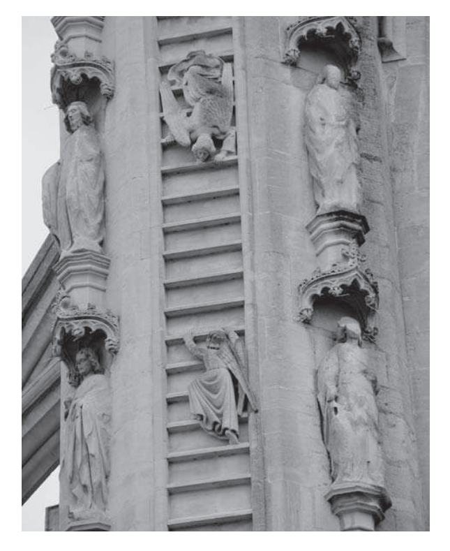
Fig. 2. Cathedral in Bath, west front, fragment of the ladder of virtues on the north side

X. Katedra w Bath, elewacja zachodnia, fragment drabiny cnót po stronie północnej