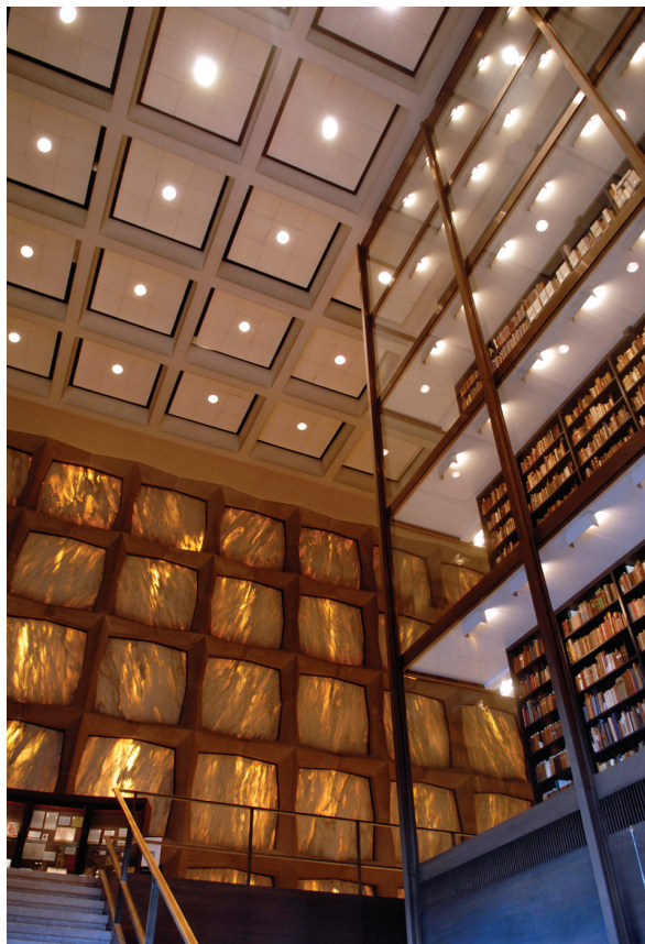
Fig. 2. Beinecke Rare Book and Manuscript Library.

II. 2. Beinecke Rare Book and Manuscript Library.