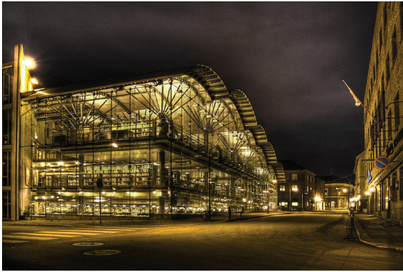
Fig. 3. Tønsberg og Nøtterøy bibliotek.

Il. 3. Tønsberg og Nøtterøy bibliotek.