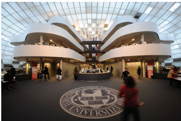
Fig. 1. Philologische Bibliothek – Freie Universität Berlin.

II. 1. Philologische Bibliothek – Freie Universität Berlin.