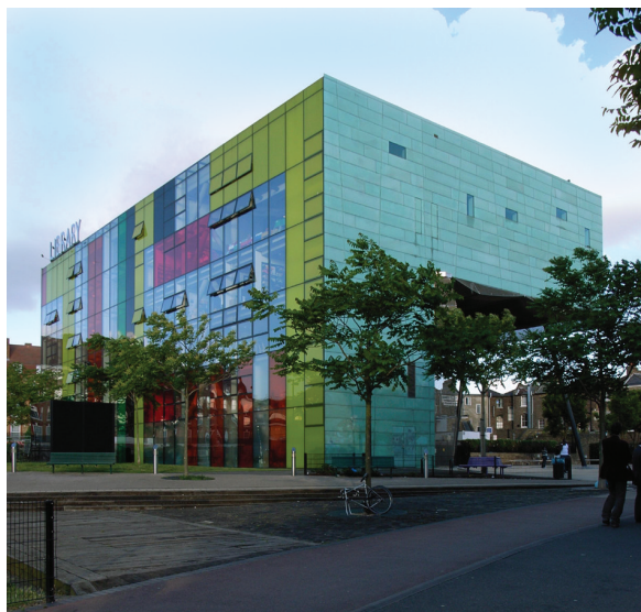
Fig. 4. Peckham library.

As a rule storage places are functional, which for libraries over the last several years has been brought up as their fundamental value. Modern designs – despite the fact that that current is in reverse – have dominated thinking about libraries so much that the recommendations made by Henry Faulkner-Brown still in the 1970s [11, pp. 3–8] are quoted by librarianship experts almost like a mantra all over the world. However, the functionality is not a simple consequence of standardization and universality. It is also an expression of local construction needs and fads. Although, postmodern architecture, or more precisely one of its currents – deconstruction, unlike modern architecture, draws from cultural patterns, including ethnic ones [12, p. 21], the modern man – as Chantal Delsol put it – is not certain of the values of those cultural references and – at the most – communicates them timidly [9, p. 76]. It is quite paradoxical in the context of the opinions, which were audaciously promoted already before the war – even in Poland – on taking into account the national cultural distinctions and social structures in architecture and design [28, p. 3–4]. However, retouching our own culture and “filtering”