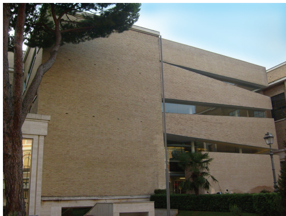
Fig. 6. Biblioteca Pio IX – Pontificia Università Lateranense.

Biblioteca Pública del Estado de Jalisco Juan José Arreola in Guadalajara which was opened in 2011 is an example which seems to illustrate that we are running out of symbols expressed in the solutions applied in the library construc-