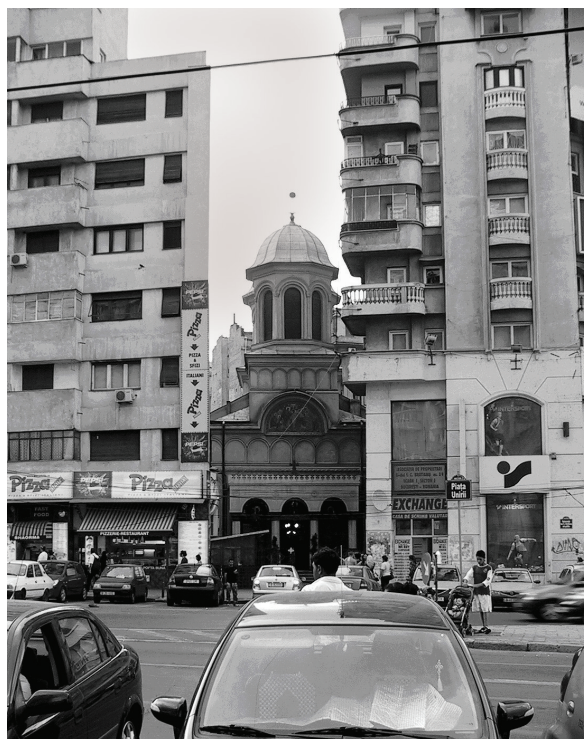
Fig. 14. Historic Orthodox Church hidden among socialist architecture around Piata Unirii

Ceașescu's activities resulted in irreversible changes in the face of Bucharest. The diverse historic landscape of the city was replaced with a monotonous and oversized urban design. The only remains of the destroyed district are its historic orthodox churches and monasteries which for ideological reasons were blocked by new buildings or hidden inside the quarters (Fig. 14).