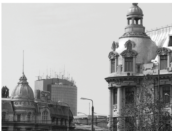
Fig. 6. Eclectic architecture of Piața Universității

Over the last two decades of the 19 th century, a number of representative buildings of public utility and government administration were erected in the area of the