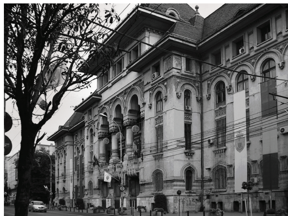
Fig. 4. Town Hall in Bucharest (1906–1910) designed in the Neo-Romanian style by Petre Antonescu

II. 3. Cerkiew Kretzulescu (1720–1722) na placu Rewolucji