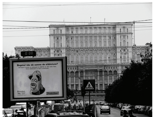
Fig. 12. The Palace of the Parliament (former People’s House) at the closing of the viewing axis

The schematic and monumental architecture of these buildings is a combination of socialist realism, a sort of Ricardo Bofill’s European post-modernism and the style of official building in North Korea, with which the dictator maintained close relations (Fig. 13).