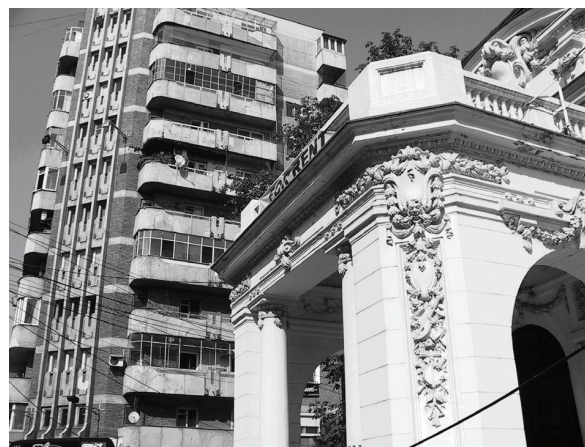
Fig. 7. City house with rich decorations from the period of the "Little Paris" (photo: W. Januszewski)

Il. 6. Eklektyczna zabudowa Piața Universității (fot. W. Januszewski)