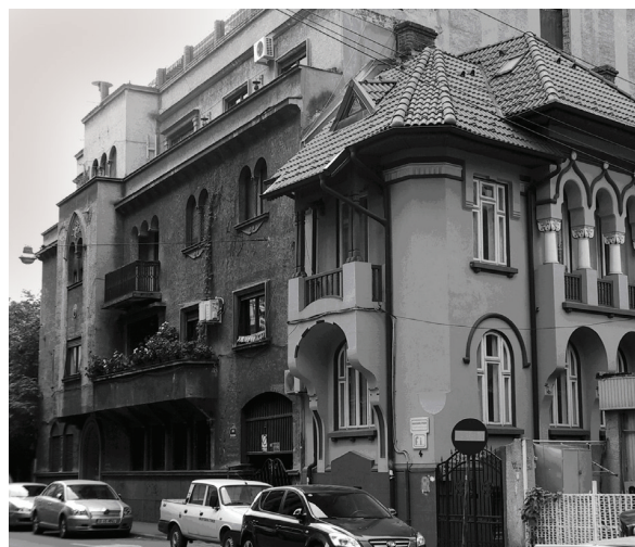
Fig. 5. In the foreground, Neo-Romanian city house; in the background, modern building with details inspired by indigenous style

The indigenous style has numerous variations which vary depending on the moment of origin and the architect's ingenuity. Apart from academic examples of the Neo-Romanian school, the indigenous elements were introduced selectively into eclectic architecture and even modern designs from the 1930s (Fig. 5).