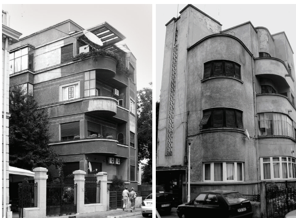
Fig. 10. Examples of modern houses in Bucharest

II. 9. Współistnienie modernizmu i eklektyzmu