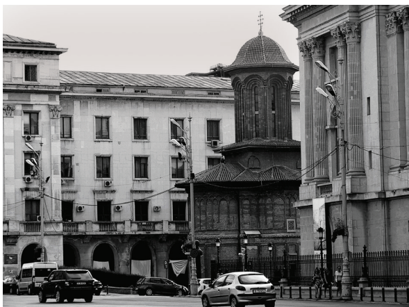
Fig. 3. Kretzulescu Orthodox Church (1720–1722) in the Revolution Square

At the beginning of the 20 th century, after a period of uncritical fascination with the Western European patterns, these buildings inspired the architects who wished to express the national ideas (Fig. 4). One of the most prominent repre-