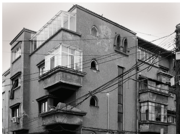
Fig. 11. Modern body of the building and historicizing detail

II. 10. Przykłady modernistycznych domów w Bukareszcie