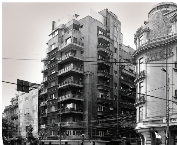
Fig. 9. Coexistence of modernism and eclecticism

II. 8. Modernistyczna zabudowa Boulevardul Magheru – budynek towarzystwa ubezpieczeniowego z 1929 r. – arch. Horia Creanga