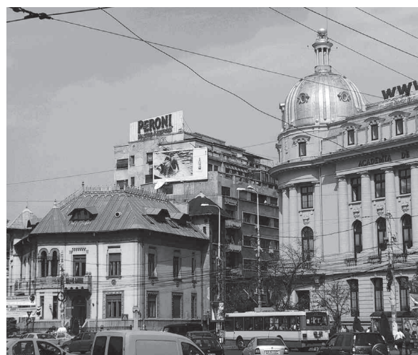
Fig. 1. Neo-Romanian style, modernism and eclecticism in architecture of Piața Romăna

a myriad of directions which formed under the influence of Western European ideas. On the other hand, the picturesque disorder of Bucharest and the magnificence