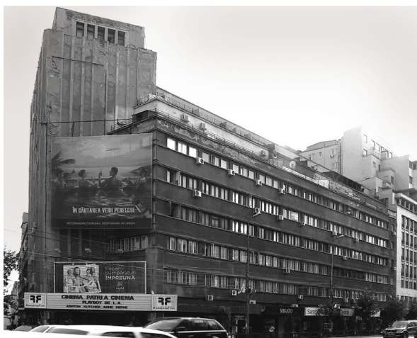
Fig. 8. Modern architecture of Boulevardul Magheru – ARO insurance building from 1929 – designed by Horia Creanga

cultural life at that time. Its advocates gathered around Contimporanul – a magazine published between 1924 and 1934. It was a forum for the young generation of designers who adopted the ideas of architecture of the Bauhaus, Le Corbusier or de Stijl. Hundreds of new buildings in the