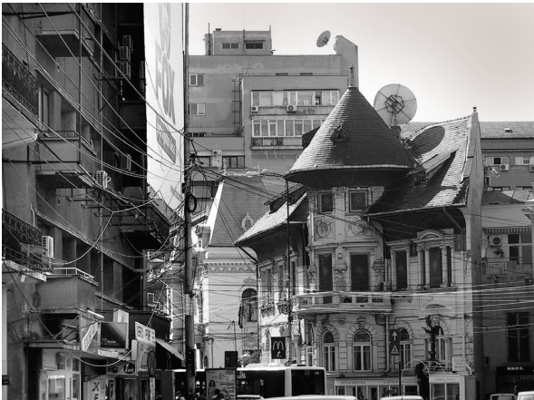
Fig. 2. Diversified architecture of Bucharest center

II. 2. Zróżnicowana zabudowa śródmieścia Bukaresztu