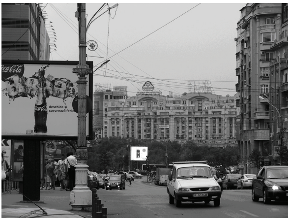
Fig. 13. View of former "Socialist City"

Il. 13. Widok dawnego „Miasta Socjalistycznego”