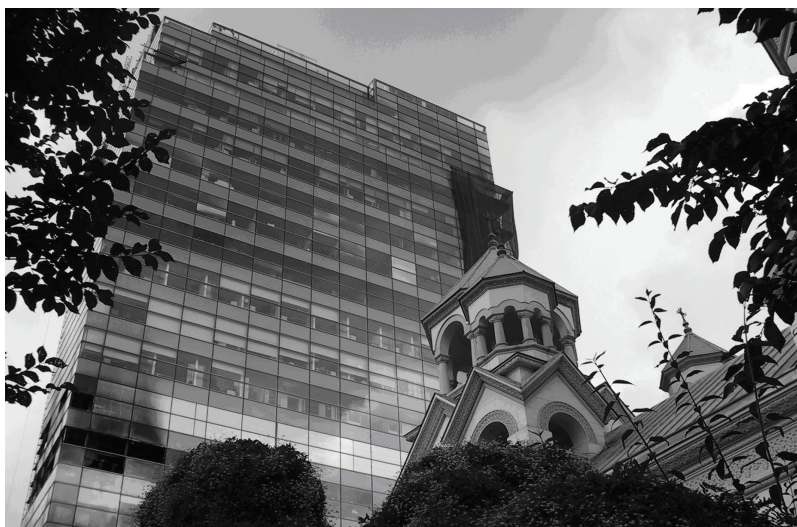
Fig. 15. Controversial investments by the Catholic Cathedral and Armenian Church

Romania adopted the market economy. The People's House – currently the Palace of the Parliament – became tourist attraction and former commodity warehouses were