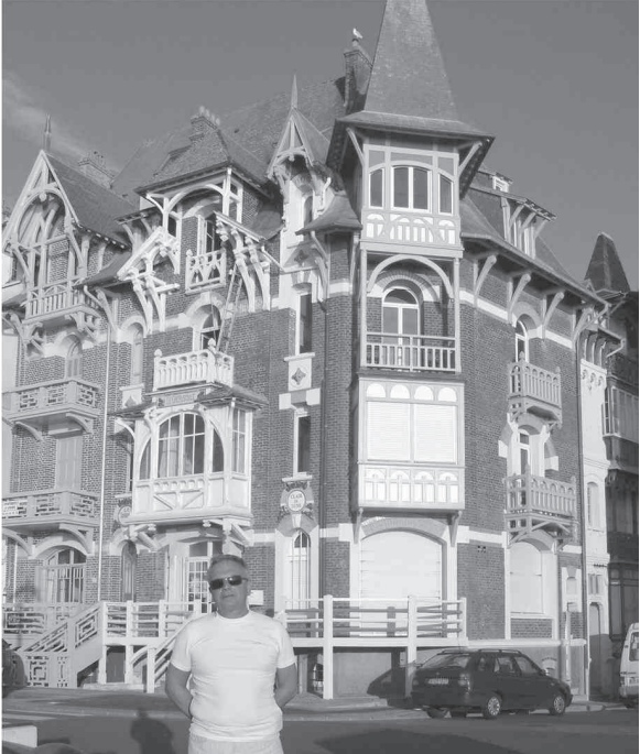
Fig. 4. Claire de Lune Villa II. 4. Willa Claire de Lune

ers is an example of the neo-regional style (Fig. 4). The other two are Le Tourbillon and Le Crépuscule which were built in 1902–1905 according to the design by the architect Georges Guyon. The whole complex has been remodeled a number of times but after it was thoroughly renovated it still presents the model characteristic features of the convention [2].