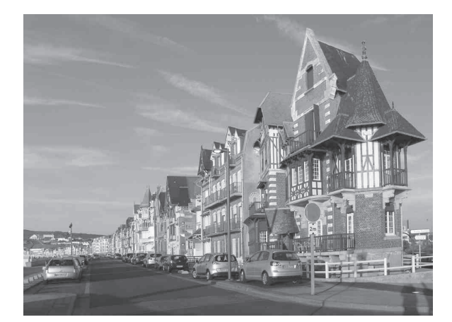
Fig. 1. Mers-les-Baines (photo by M.J. Żychowska, 2011)

Il. 1. Mers-les-Baines (fot. M.J. Żychowska, 2011)