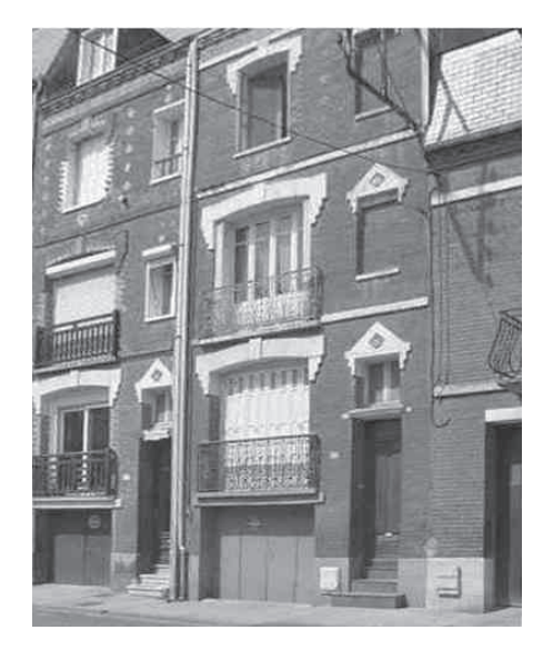
Fig. 5. Two-family La Mésange Villa

Il. 5. Dwurodzinna willa La Mésange