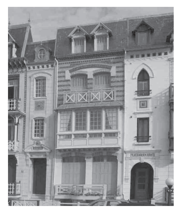
Fig. 3. Rip Villa Il. 3. Willa Rip