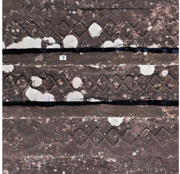
Fig. 5. Lichens on a fragment of the so-called "Big Snake" petroglyph

Partial project results were also presented at the UNESCO headquarters in Paris in April 2017 during the exhibition "Against the Sands of Time. Documentation and Reconstruction of the World Heritage – the Polish Experience", which promoted Polish achievements in the field of conservation of sites from the World Heritage List, and also in July 2017 at the exhibition for the 41<sup>st</sup> Session of the UNESCO World Heritage Committee in Krakow.