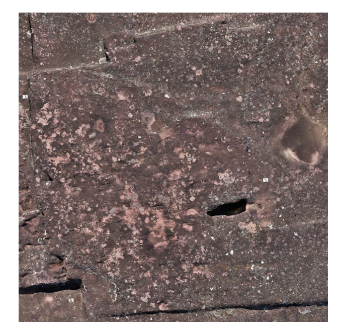
Fig. 2. The place where the petroglyph depicting an ostrich once existed