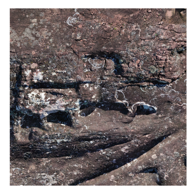
Fig. 4. Erosion of a petroglyph representing two pumas

Archeaology of Non-European Cultures (Kommission für Archäologie Außereuropäischer Kulturen, KAAK) and CIAS (July 2015–May 2016);