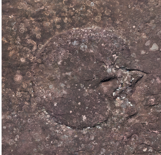
Fig. 3. Indecipherable petroglyph probably depicting a puma

3. to develop scientific and technical studies and research and to work out such operating methods as will make the State capable of counteracting the dangers that threaten its cultural or natural heritage; [...].