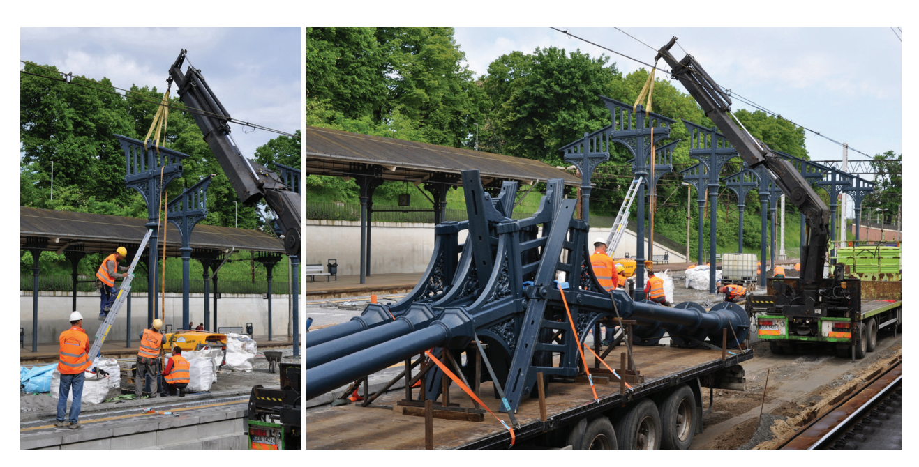
Fig. 3. Gdańsk Główny railway station, works of reassembly of the renovated cast-iron pillars of platform No. 2, 2018 II. 3. Gdańsk Główny, dworzec PKP, prace przy ponownym montażu odnowionych żeliwnych słupów zadaszenia peronu 2, stan z 2018 r.