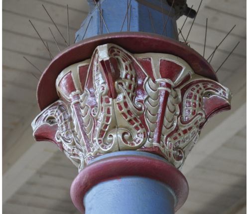
Fig. 6. Sopot railway station, general view and construction detail of the platform shelter on the long-distance platform created about 2011, the state in 2020

II. 6. Sopot, dworzec PKP, widok ogólny i detal konstrukcji wiaty peronowej na peronie dalekobieżnym zrealizowany około 2011 r., stan z 2020 r.