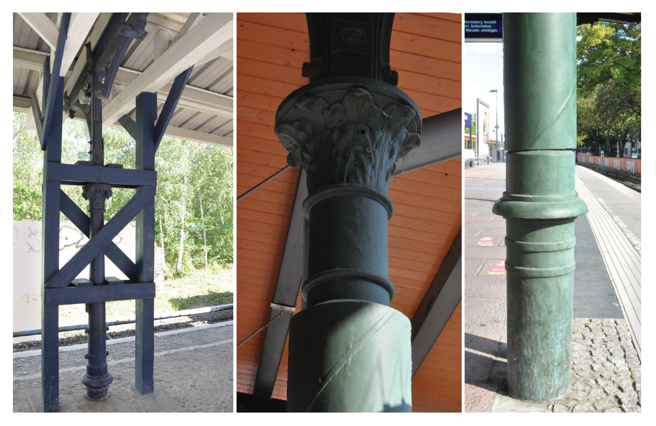
Fig. 9. Berlin, examples of repair work on cast-iron columns of platform shelters in S-Bahn stations, the state in 2019

II. 9. Berlin, przykłady prac naprawczych żeliwnych słupów wiat peronowych na stacjach S-Bahn, stan z 2019 r.