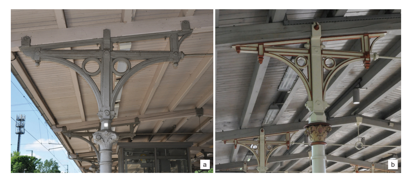
Fig. 4. Comparison of the upper parts of cast-iron columns supporting platform shelters: a) Berlin S Wannsee Bahnhof, 2019, b) Sopot, 2020