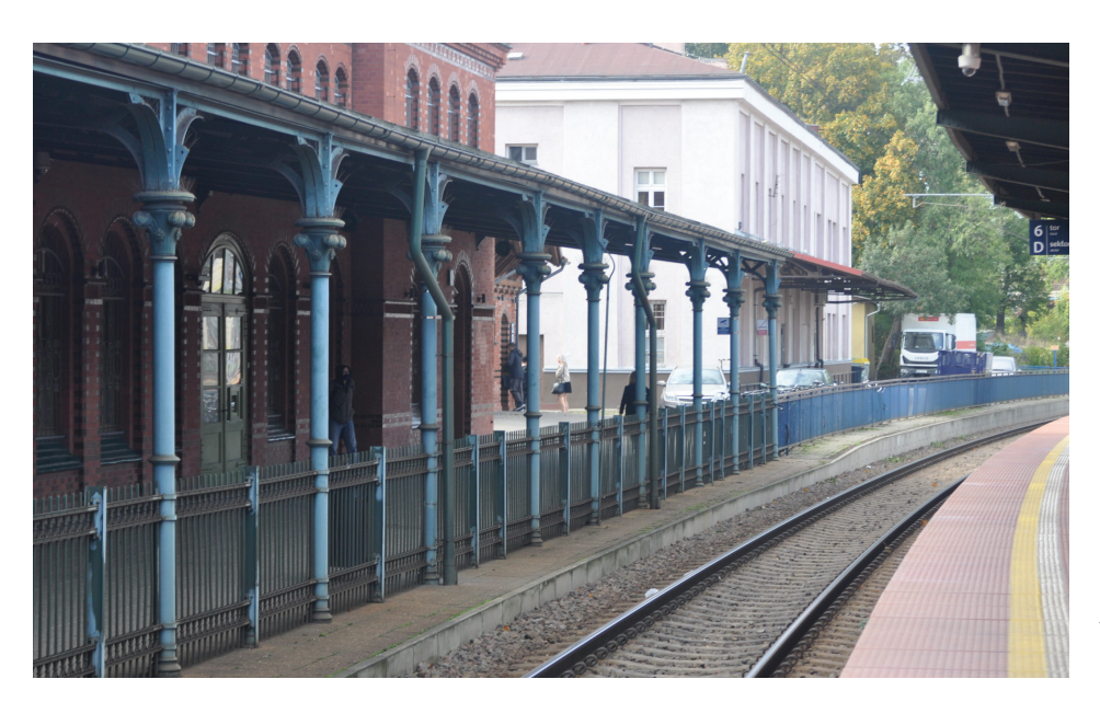
Fig. 7. Malbork railway station, single-pitched platform shelter with cast-iron pillars, the state in 2020

II. 6. Sopot, dworzec PKP, widok ogólny i detal konstrukcji wiaty peronowej na peronie dalekobieżnym zrealizowany około 2011 r., stan z 2020 r.