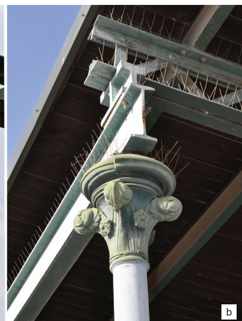
Fig. 8. Malbork railway station, detail of the head of the cast-iron pillar of the platform shelter before and after the installation of the decorative overlays: a) the state in 2014, b) the state in 2020

II. 8. Malbork, dworzec PKP, detal głowicy żeliwnego słupa wiaty peronowej przed zamontowaniem dekoracyjnych nakładek i po zamontowaniu: a) stan z 2014 r., b) stan z 2020 r.