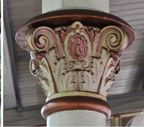
Fig. 5. Sopot railway station, general view and construction detail of the 19<sup>th</sup>-century cast-iron platform shelter on the platform of the SKM (Rapid Urban Railway), 2020

II. 5. Sopot, dworzec PKP, widok ogólny i detal konstrukcji XIX-wiecznej żeliwnej wiaty peronowej na peronie Szybkiej Kolei Miejskiej, stan z 2020 r.