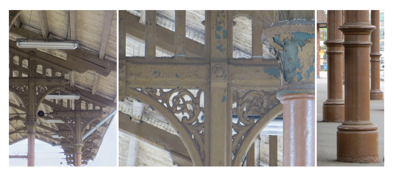
Fig. 2. Gdańsk Główny railway station, platform No. 2 roofing, 2012 II. 2. Gdańsk Główny, dworzec PKP, zadaszenie peronu 2, stan z 2012 r.

wood frames had their transverse spacing of posts reduced. The shelter on the north side was extended<sup>14</sup>. The five metal structural frames installed there have been given a simplified form reminiscent of the historical one. The new elements were to receive a distinctive colour, and the platform's floor was to be differentiated by the material to emphasize the various times of construction. At present, it is not definite whether this idea was not carried out or whether subsequent actions obliterated the distinction. By 2017, the shelters on other Gdańsk platforms underwent essential repair works, primarily to improve their visual condition. These mainly included the lower parts of the poles and entailed cleaning them and applying new paint layers (Fig. 2). Between 2014 and 2017, another coat of paint was applied to the cast-iron structure, which referred to the original one - dark blue. It was noticeable in the upper (unpreserved) parts of the columns (Fig. 2) and was further confirmed by stratigraphic examination in 2014<sup>15</sup>. Comprehensive works were undertaken in 2017 to the platform 1 and platform 2 shelters have involved removing their roof sheathing and the cast-iron supports on the platforms, which were out of service for the time.