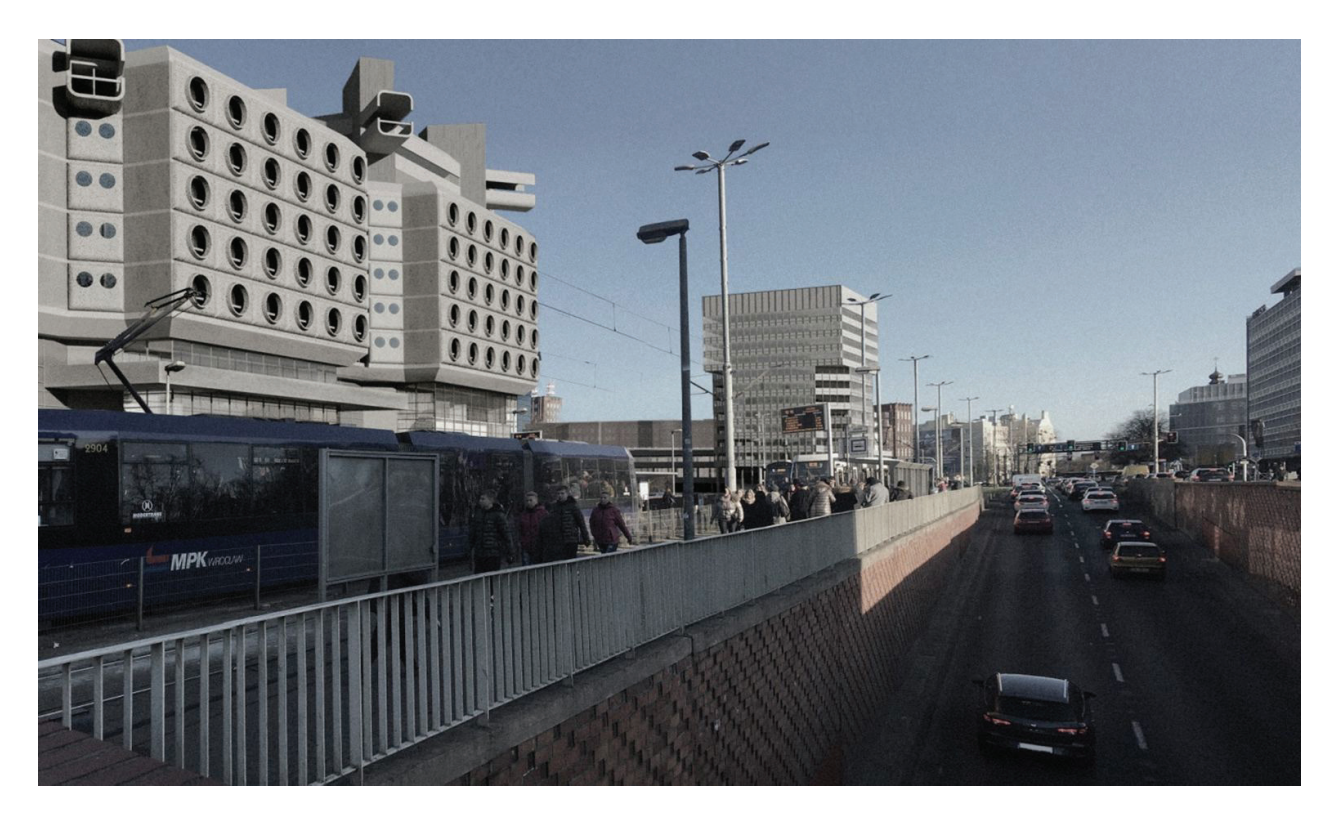
Fig. 7. Visualisation of the mixed-use centre at Dominikański Square, designed by J. Grabowska-Hawrylak, in cooperation with: K. Sąsiadek (1972–1976) – view from the side of Dominikański Square, with the tower building that is part of the Main Post Office extension in the background, designed by J. Grabowska-Hawrylak, in cooperation with: J. Kaśnicki, K. Sąsiadek (1971) (model and visualisation by Ł. Wojciechowski)

II. 6. Wizualizacja centrum wielofunkcyjnego przy placu Dominikańskim, proj. J. Grabowska-Hawrylak, współpraca: K. Sąsiadek (1972–1976) – widok od strony ul. Traugutta, na pierwszym planie wieżowiec stanowiący rozbudowę Urzędu Pocztowego, proj. J. Grabowska-Hawrylak, współpraca: J. Kaśnicki, K. Sąsiadek (1971) (model i wizualizacja: Ł. Wojciechowski)