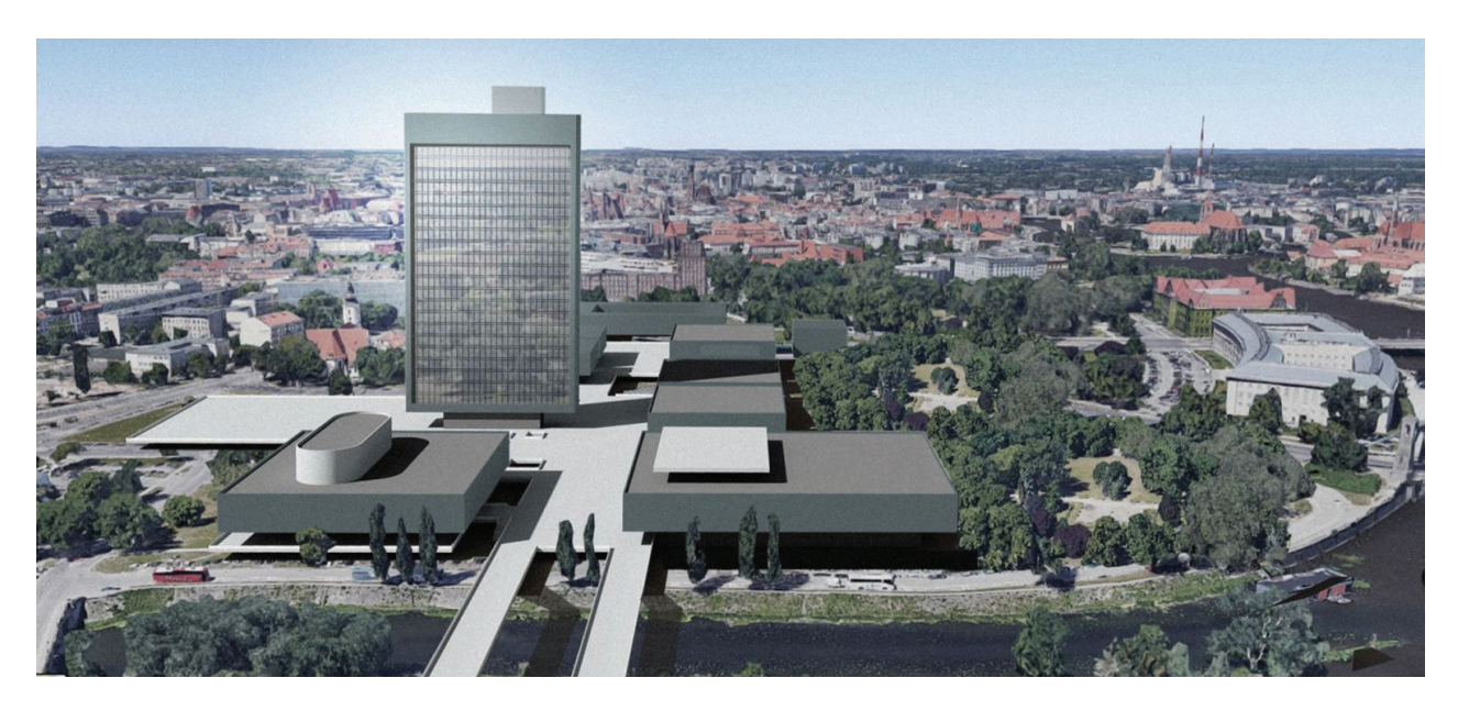
Fig. 4. Visualisation of the development at Plac Społeczny, designed by W. Jackiewicz, Z. Prętczyński, R. Tunikowski (1964) – birds-eye view from the side of the River Oława (model and visualisation by Ł. Wojciechowski, background image source: Google Maps)

II. 4. Wizualizacja zabudowy placu Społecznego, proj. W. Jackiewicz, Z. Prętczyński, R. Tunikowski (1964)