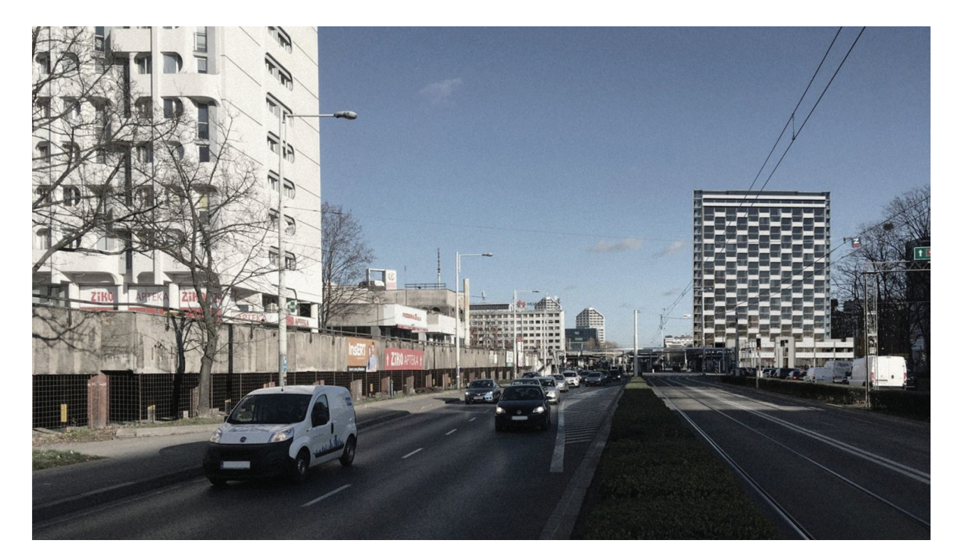
Fig. 3. Visualisation of the student dormitory on Grunwaldzki Square, designed by J. Grabowska-Hawrylak, in cooperation with: K. Sąsiadek (1972) – view from the side of the Grunwaldzki Bridge along with the Plac Grunwaldzki housing complex (model and visualisation by Ł. Wojciechowski)

ing does not continue the building lines defined by prewar development. The tower building is a visual landmark that dominates the Grunwaldzka axis and is clearly visible from the side of the Grunwaldzki Bridge. The design was prepared at the start of the 1970s during the construction of the Plac Grunwaldzki housing and services complex, which was also designed by Grabowska-Hawrylak's team at Miastoprojekt. The student hotel is higher than the