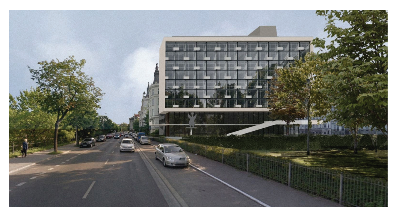
Fig. 9. Visualisation of the Tourist House at Podwale Street, designed by T. Brzoza, W. Jackiewicz, O. Mucha, R. Tunikowski (1960) view from the side of Podwale Street (model and visualisation by Ł. Wojciechowski, background image source: Google Maps)

n. 8. wizualizacja centrum wielofunkcyjnego przy piacu Dominikanskim, proj. S. Müller, M. Rychlicki (1970) – widok od strony kościoła św. Wojciecha (model i wizualizacja: Ł. Wojciechowski)