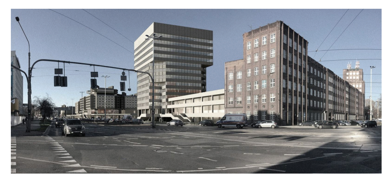
Fig. 6. Visualisation of the mixed-use centre at Dominikański Square, designed by J. Grabowska-Hawrylak, in cooperation with: K. Sąsiadek (1972–1976) view from Traugutta Street, with the tower building that is part of the Main Post Office extension in the foreground, designed by J. Grabowska-Hawrylak, in cooperation with: J. Kaśnicki, K. Sąsiadek (1971) (model and visualisation by Ł. Wojciechowski)

II. 6. Wizualizacja centrum wielofunkcyjnego przy placu Dominikańskim, proj. J. Grabowska-Hawrylak, współpraca: K. Sąsiadek (1972–1976) – widok od strony ul. Traugutta, na pierwszym planie wieżowiec stanowiący rozbudowę Urzędu Pocztowego, proj. J. Grabowska-Hawrylak, współpraca: J. Kaśnicki, K. Sąsiadek (1971) (model i wizualizacja: Ł. Wojciechowski)