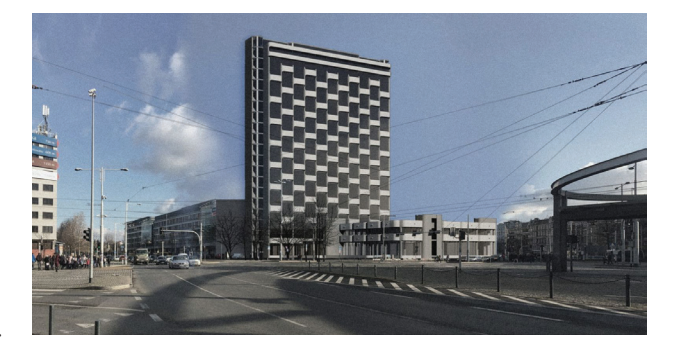
Fig. 2. Visualisation of the student dormitory on Plac Grunwaldzki, designed by J. Grabowska-Hawrylak, in cooperation with: K. Sąsiadek (1972) view from the side of Pasaż Grunwaldzki (model and visualisation by Ł. Wojciechowski)

This building, designed on Plac Grunwaldzki, consists of a student hotel located inside an eighteen-storey tower building with a superstructure and a two-storey pavilion with a coffee shop and club spaces. Both masses are linked with a single-storey corridor that houses the entrance to both sections and whose roof has a usable terrace. The building was located in the eastern section of the square, between Curie-Skłodowskiej and Norwida streets, in place of the present-day Grunwaldzki Center office building. The Modernist free-standing block build-