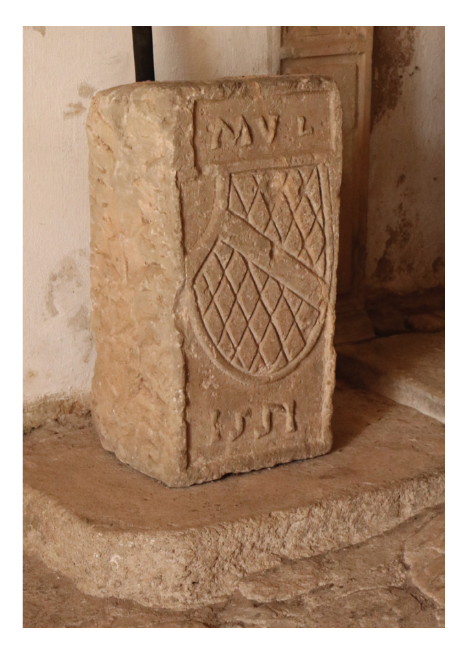
Fig. 3. A block of stone of Matthäus von Logau with the coat of arms and the date displayed in the entrance hall of the upper castle (photo by A. Gryglewska, 2019)

II. 3. Cios kamienny Matthäusa von Logau z herbem i datą eksponowany w sieni górnego zamku (fot. A. Gryglewska, 2019)