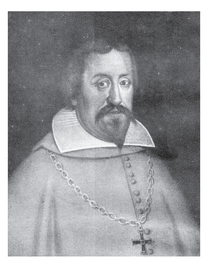
Fig. 2. Portrait of Bishop Kaspar von Logau in the years 1562–1574 II. 2. Portret biskupa Kaspara von Logau w latach 1562–1574

of the lease pledge obtained the right to enrich their property with new lands, mills and farms [18, p. 6].