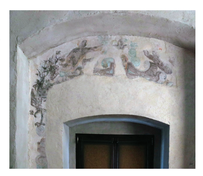
Fig. 5. Window recess with relics of polychrome from the 2<sup>nd</sup> half of the 16<sup>th</sup> century in the room on the second floor of the eastern wing of the castle II. 5. Wnęka okienna z reliktami polichromii z 2. połowy XVI w.

The distribution of representative and residential functions in the castle was the result of a compromise and the adaptation of the interiors arranged by the Czettritz family at the beginning of the 16<sup>th</sup> century. The large hall on the third floor probably retained its representative function.