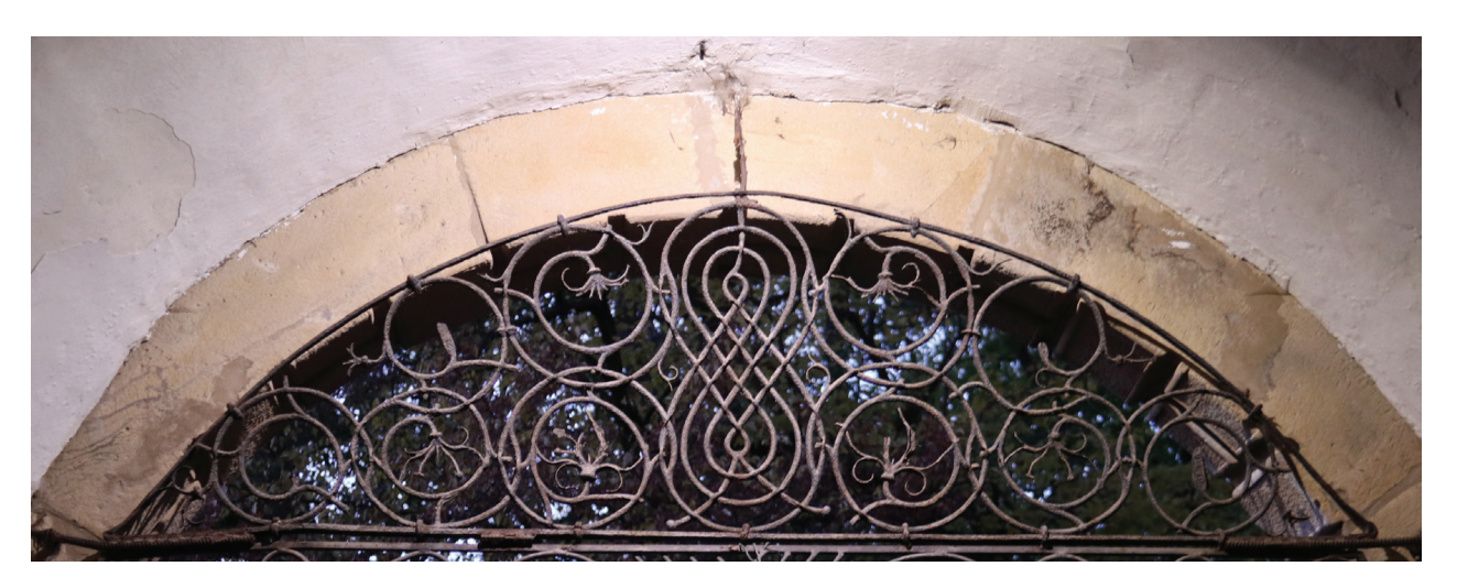
Fig. 10. Grille in the gate of the lower gatehouse. View from the inside

II. 10. Krata w bramie dolnego budynku bramnego. Widok od strony wnętrza