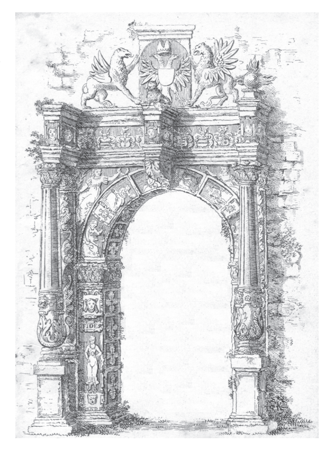
Fig. 1. Foregate portal on the cover of August Zemplin's book (drawing from around 1823, source: [2], in the collection of the University Library in Wrocław)

II. 1. Portal przedbramia na okładce książki Augusta Zemplina (rys. ok. 1823 r., źródło: [2], w zbiorach Biblioteki Uniwersyteckiej we Wrocławiu)