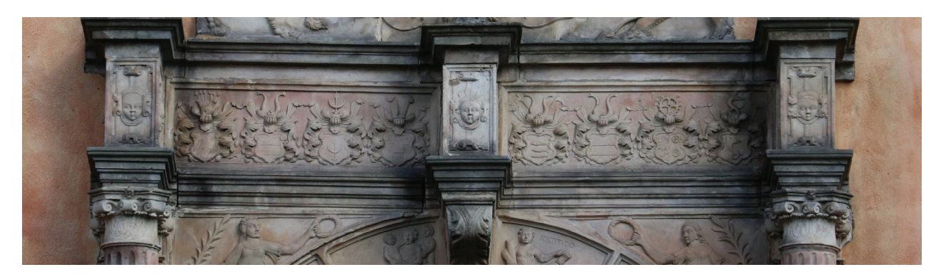
Fig. 4. Fragment of the foregate portal. Entablature with a frieze strip with heraldic decoration II. 4. Fragment portalu przedbramia. Belkowanie z pasem fryzu z dekoracją heraldyczną

Schmider, Matz Kunz, and Jacob Kleindienst from Świdnica ^{26} . The above names do not appear in other documents or contemporary historical studies on craftsmanship in Lower Silesia ^{27} .