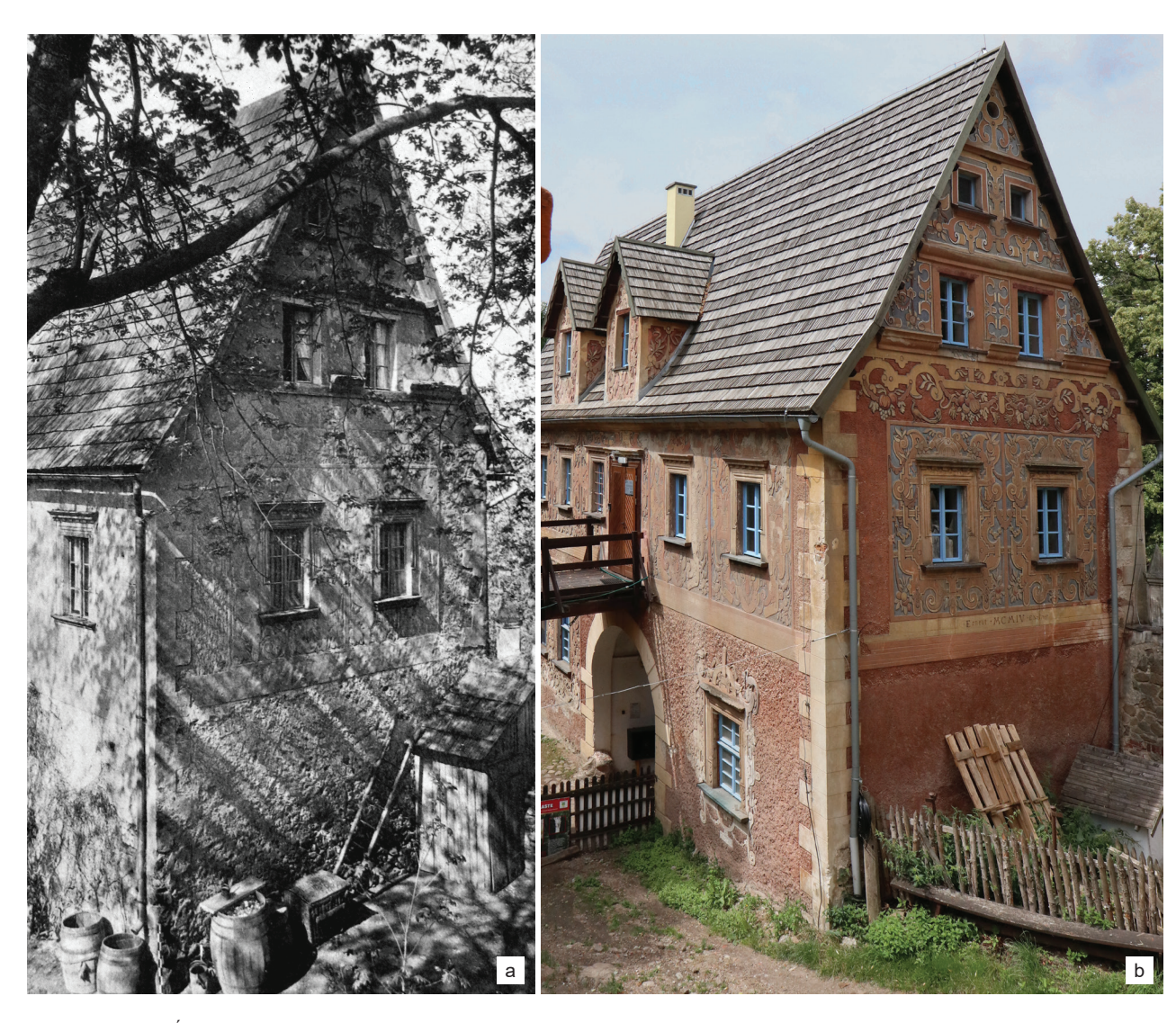
Fig. 9. Zagórze Śląskie, Grodno Castle. The gatehouse of the lower castle: a) view from the north-east with the original sgraffito decoration, photo from around 1903 (after: [25, Taf. 90.2]), b) view from the north-east with the sgraffito decoration reconstructed in 1904 (photo by A. Gryglewska, 2019)