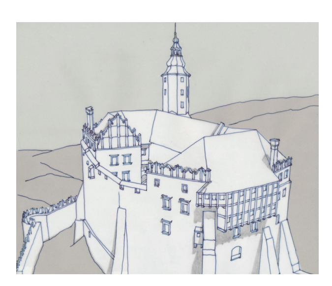
Fig. 7. Grodno Castle in around 1600. Visualization of the upper castle from the north-west (elaborated by A. Gryglewska, A. Kubicka)

Il. 7. Zamek Grodno ok. 1600 r. Wizualizacja górnego zamku w ujęciu od północnego zachodu (oprac. A. Gryglewska, A. Kubicka)