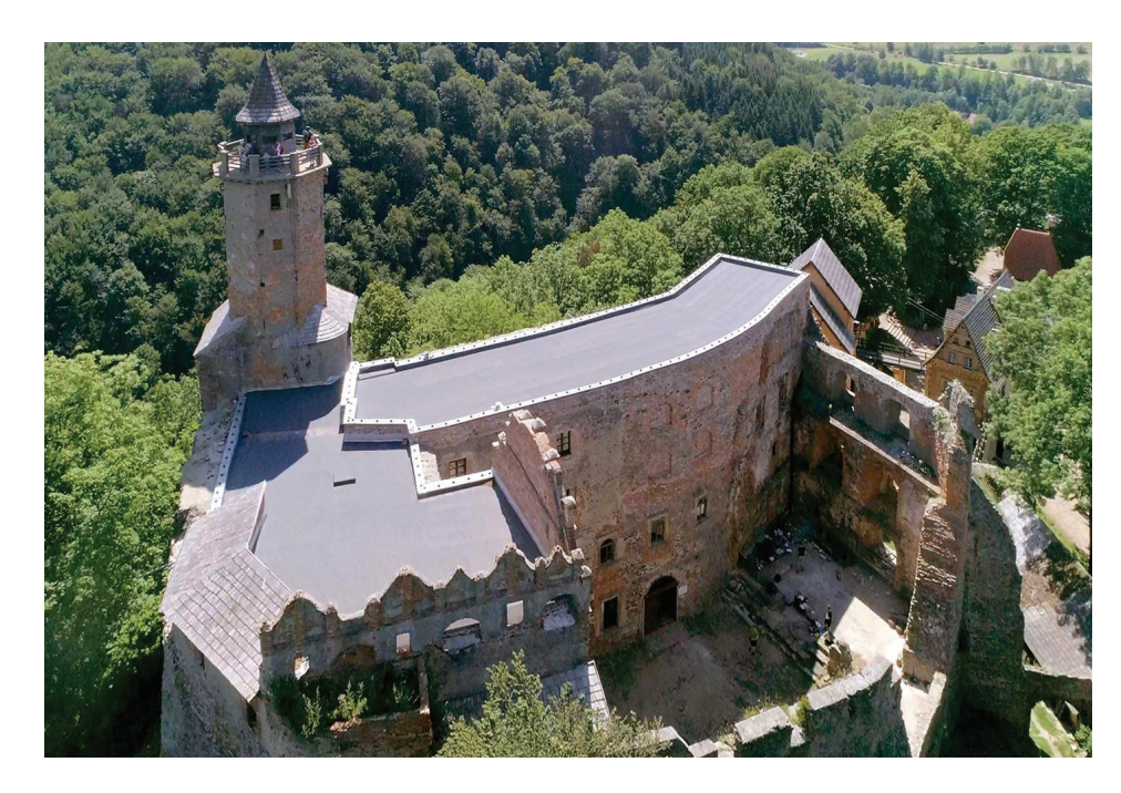
Fig. 6. Grodno Castle from the northern side. View from a drone Il. 6. Zamek Grodno od strony północnej. Widok z drona