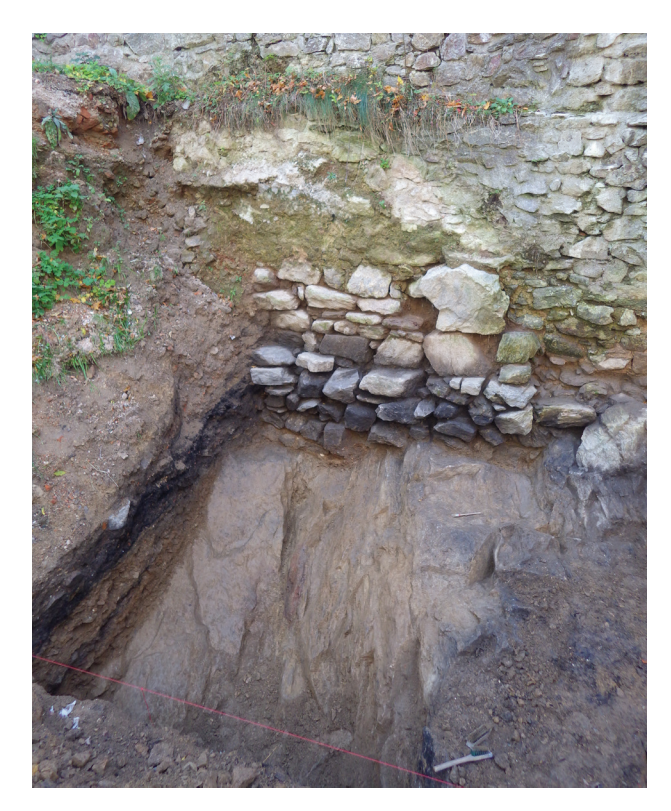
Fig. 3. Probing excavation No. 5 at the wall of the upper castle II. 3. Wykop sondażowy nr 5 przy murze zamku górnego

bearded heads and clear inscription SPASPE . In connection with the name on the other side – BENEDICTUS XIII – this undoubtedly indicated the discovery of an artifact not often found during archaeological research, i.e., a papal bull – a personal papal seal.