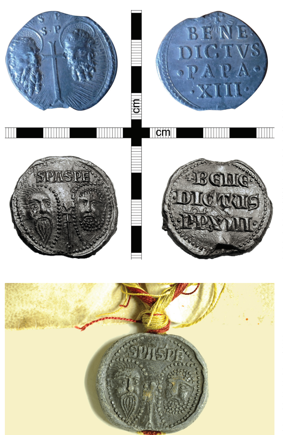
Fig. 4. Comparison of the style of seals of two popes bearing the name of Benedict XIII. At the top, the 18<sup>th</sup>-century papal bull of Pietro Francesco Orsini. At the bottom, the 14<sup>th</sup>/15<sup>th</sup>century papal bull of Pedro de Luna discovered in Grodno Castle

II. 4. Porównanie stylistyki pieczęci dwóch papieży noszących imię Benedykta XIII. U góry XVIII-wieczna bulla Pietra Francesca Orsiniego. U dołu odnaleziona na zamku Grodno XIV/XV-wieczna bulla Pedra de Luny