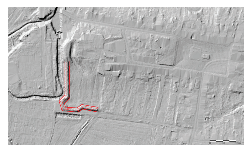
Fig. 2. Wiązów, reconstruction of the preserved bastion with curtains (elaborated by R. Śledzik-Kamiński)

II. 2. Wiązów, rekonstrukcja zachowanego bastionu z kurtynami (oprac. R. Śledzik-Kamiński)