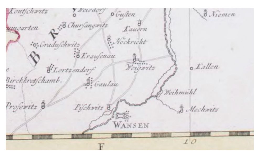
Fig. 1. Fortifications in Wiązów (German: Wansen) in the map section from 1750

In Wiązów, in the areas by the River Młynówka and Spacerowa Street (south-western part of the town), there