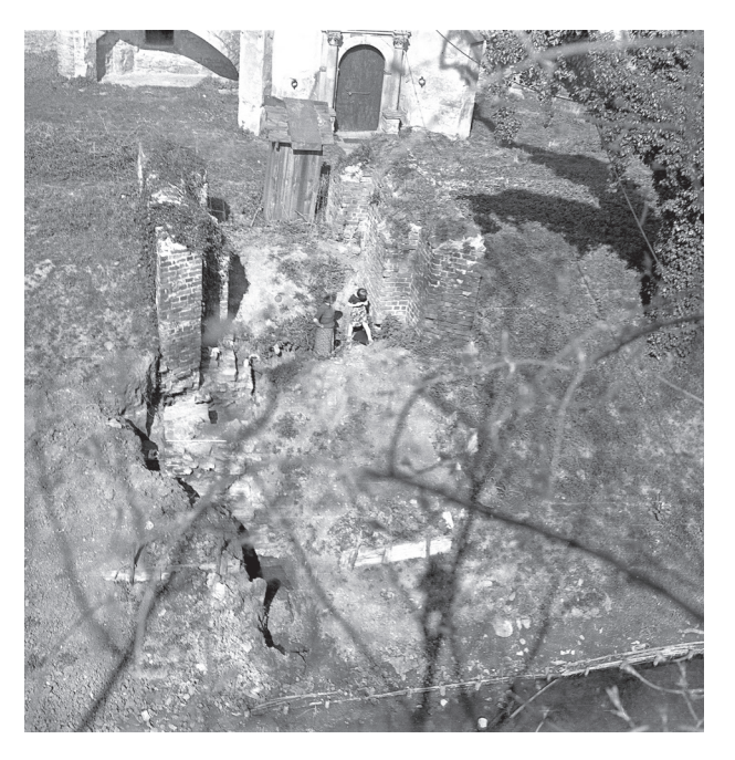
Fig. 4. Manor house in Żórawina. Southern fortress gate. Relics of the building and the outer bank of the moat

Józef Pilch recognized the son of Valentin Albrecht von Säbisch as the author of the fortifications, specifying the