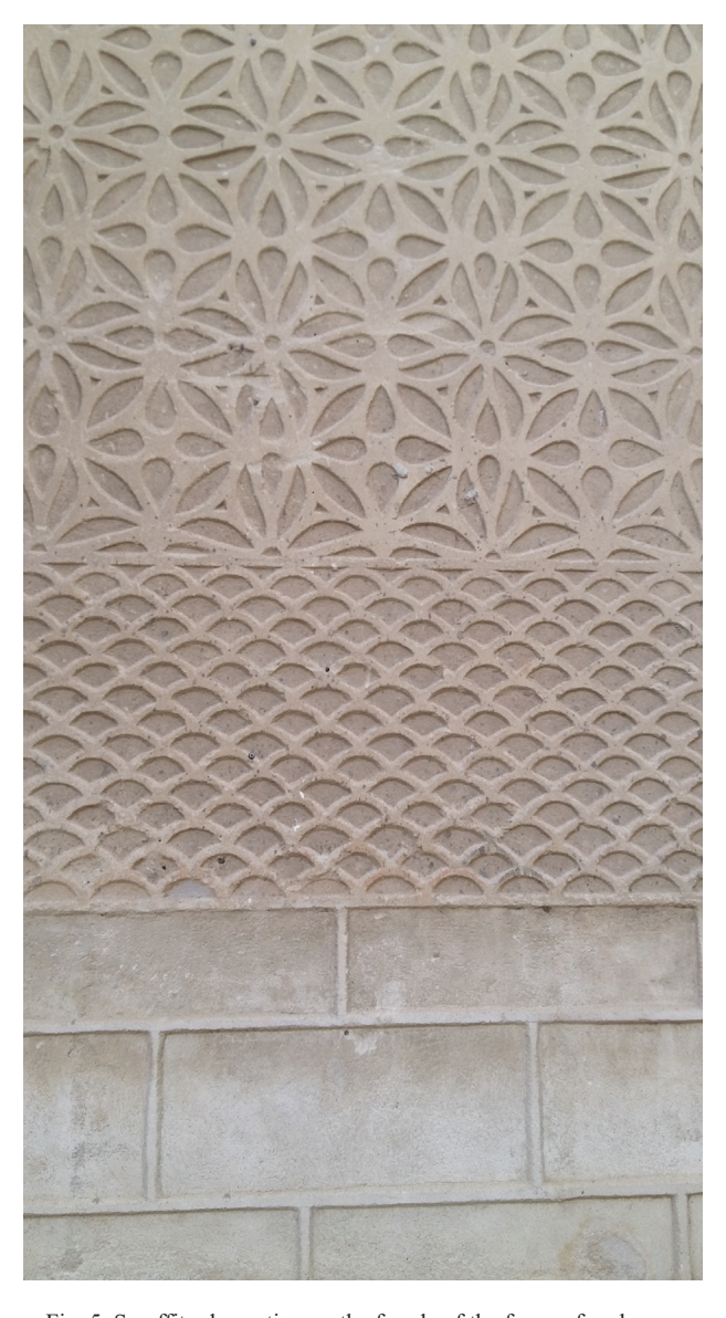
Fig. 5. Sgraffito decoration on the façade of the former farmhouse, now the Municipal Historical Archives, 10 de la Alhongido Street

Il. 4. Palacio del Conde Alpuente przy Plaza Platero Oquendo