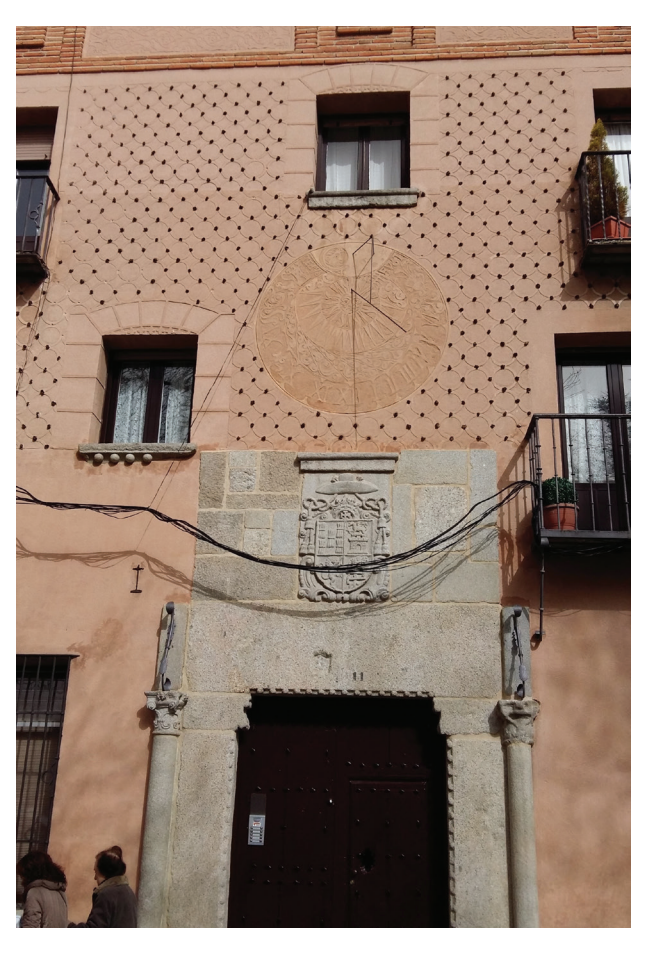
Fig. 7. Sundial on the façade of the house at 11 Plaza la Merced

There are also different technical variants such as embossed and scratched sgraffito, consisting of two or more layers, can also be made with different materials and with different tools. Finally, different stencils were used, such as metal or stone<sup>9</sup>. Thus, even using the same pattern, the final effect on the wall can be very different, making the seemingly unified façades of the buildings considerably