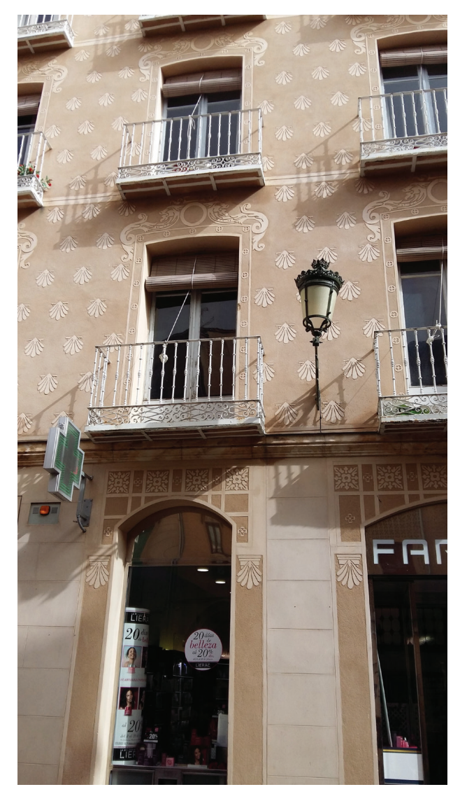
Fig. 6. Sgraffito with seashells on the tenements at 1 Plaza del Corpus and 7 Isabela Catolica Street (photo by D. Bręczewska-Kulesza)

II. 6. Sgraffito z muszelkami na kamienicach przy Plaza del Corpus 1 i ul. Izabeli Katolickiej 7 (fot. D. Bręczewska-Kulesza)