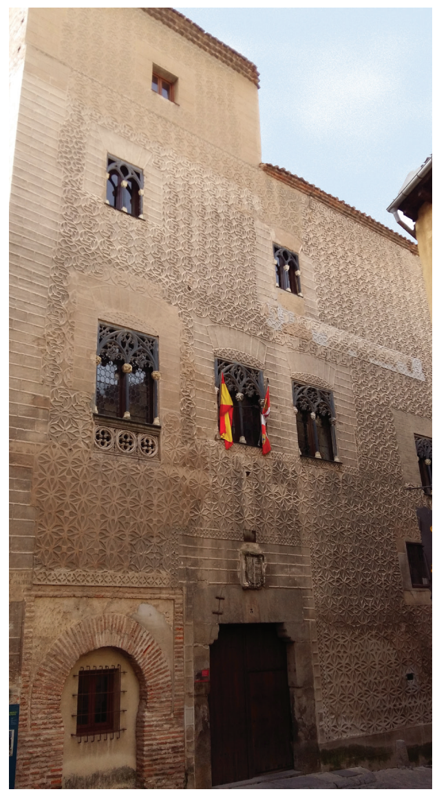
Fig. 4. The Palacio del Conde Alpuente at Plaza Platero Oquendo

Il. 4. Palacio del Conde Alpuente przy Plaza Platero Oquendo