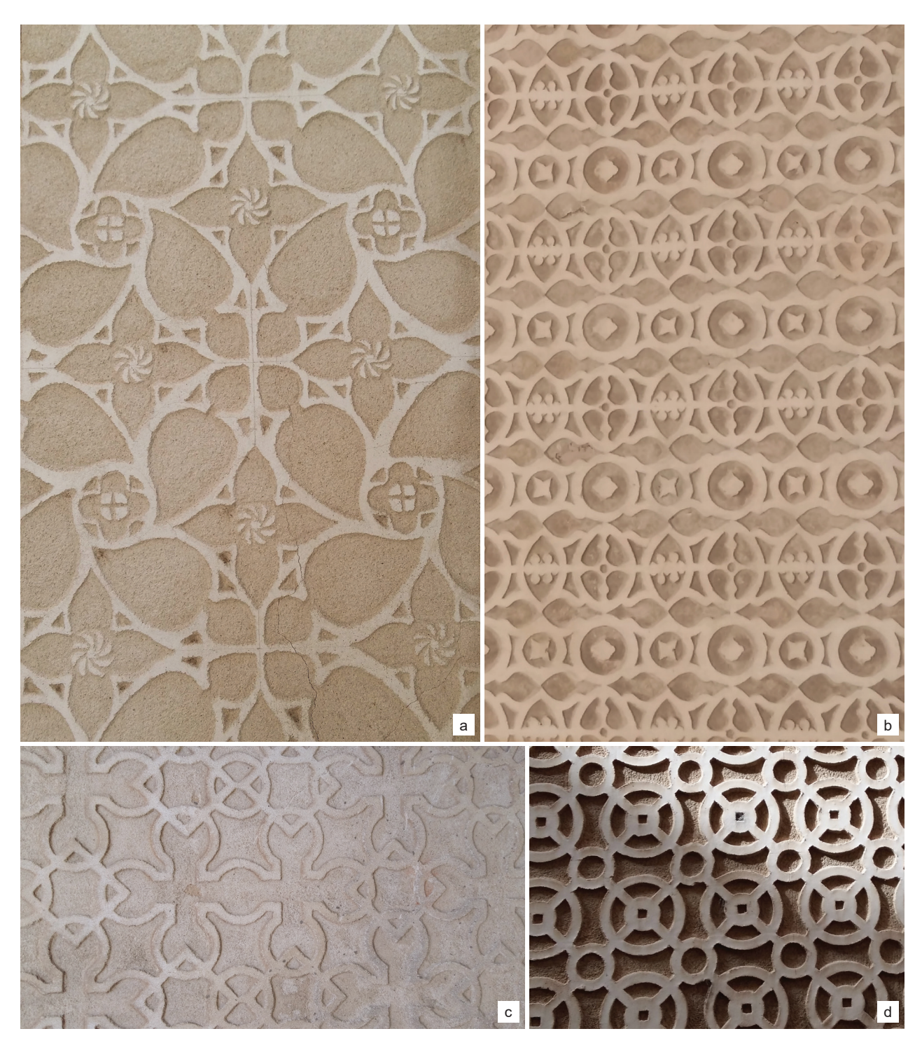
Fig. 10. Examples of sgraffito decoration on tenements II. 10. Przykłady dekoracji sgraffitowej na kamienicach

undoubtedly an original product of the local, medieval building tradition. The decorations, based on geometric figures, cover the façades of the buildings or highlight the architectural elements of most of the houses in the historic buildings of the city. Apparently similar patterns show, however, a great variety and at the same time these decorations set the tone for the whole architecture, creating a very original whole that distinguishes Segovia's buildings from other urban centers and is undoubtedly part of the city's identity.