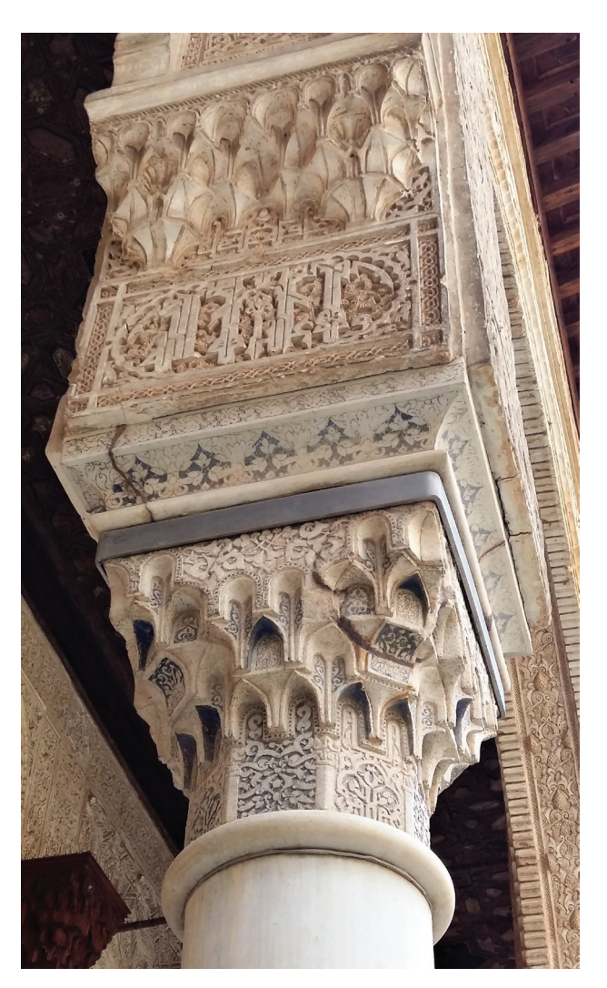
Fig. 1. Various techniques of decoration in arabic architecture – Generalife, Alhambra, Granada

The technique of wall sgraffito has given and still gives many possibilities for formal solutions of façade and interior decoration. Used in both official and residential archi-