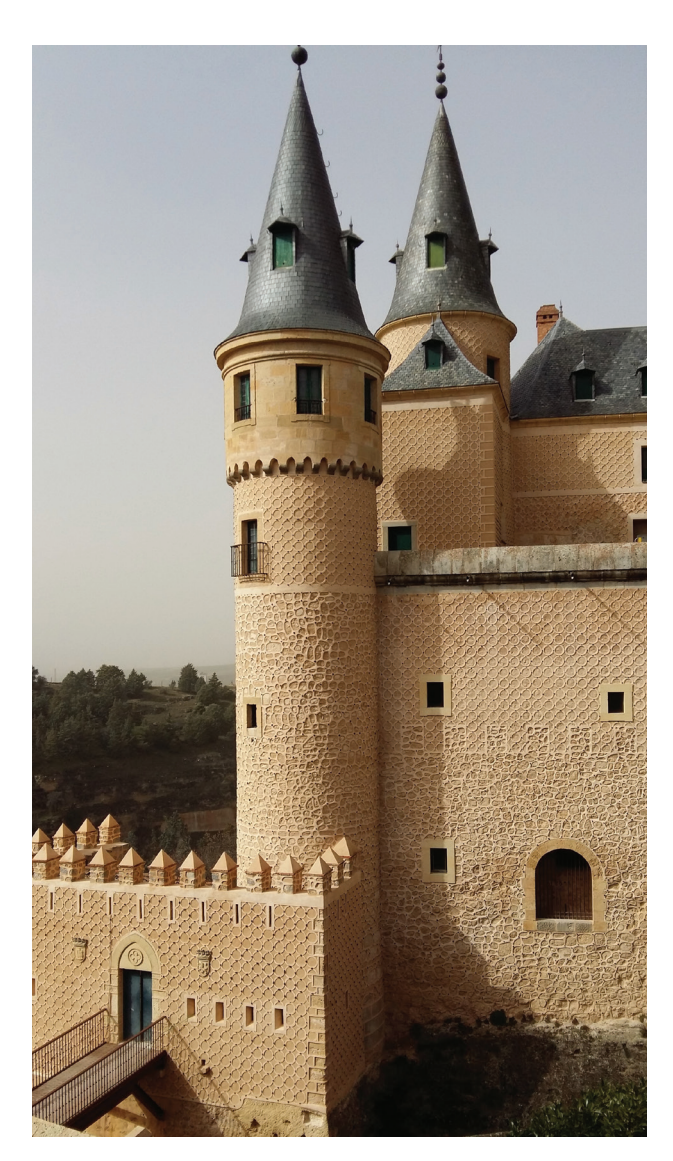
Fig. 2. The Alcázar in Segovia

The 15<sup>th</sup> century was probably the period when the "first sgraffito" was created, the decoration began to be "separated" from the stone base and forms similar to Gothic masquerade such as drops or "fish bladders" were used. This type of decoration has been preserved in the patio and tower of the Casa de los Picos [5, p. 190]. Further development of the discussed technique in the 15<sup>th</sup> and 16<sup>th</sup> centuries led to the use of repetitive, regular motifs placed on the entire façades. At that time, thanks to the Trastamar family, many mudejar decorations were created in the castle chambers. The similarity of the forms and the