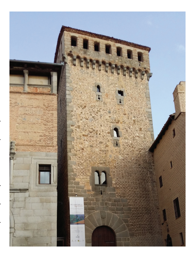
Fig. 3. The Torreón de Lozoya at 5 Plaza San Martín / Plaza de Medina del Campo

The most numerous group are the sgraffito with geometric ornaments, which were made with stencils in the 19<sup>th</sup> and 20<sup>th</sup> century. By means of various combinations of figures, by reversing the arrangement of stencils in a continuous series, alternately, according to the horizontal or vertical symmetry or by using different arrangements of figures, a lot of heterogeneous combinations were obtained. Motifs imitating stone claddings such as rustication or simple "cuts" of flagstones or other architectural elements are also quite common. Houses covered with