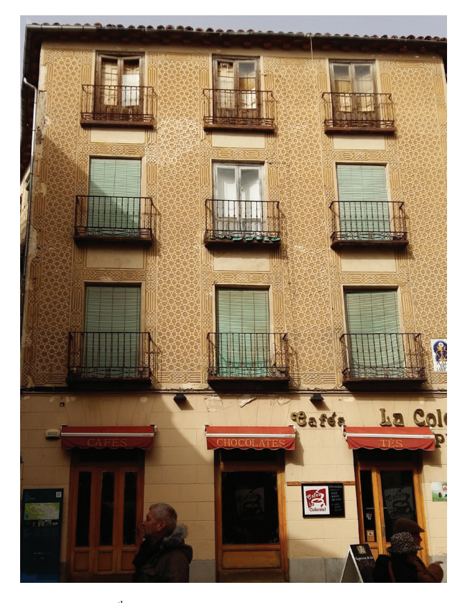
Fig. 8. A late 19<sup>th</sup>-century building with decoration on the entire façade, 14 Isabela Catolica Street

II. 8. Kamienica z końca XIX w. z dekoracją na całej fasadzie, ul. Izabeli Katolickiej 14