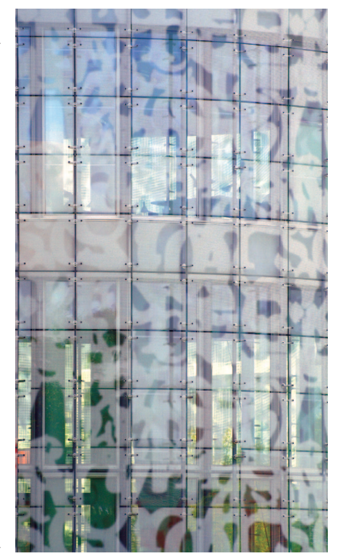
Fig. 6. IKMZ – Technical Library of Cottbus, Brandenburg Technical University, arch. Herzog & de Meuron, 2004

According to Herbert Muschamp: [...] what links [...] projects, apart from their transparent and translucent skins, is that the building's skin is used not to reveal but to veil [10, p. 43]. Glazing no longer performs a classic function of the modernistic curtain wall. New semi-opaque and translucent façades deceive the eye, and produce a magical effect of a curtain. Application of many layers of translucent and semi-opaque materials leads to the formation of zones with different light transmission characteristics. These zones are not "flat", but gain spatial depth contained between the layers of glass. A unique optical buffer is created, which is analogous to thermal and acoustic ones.