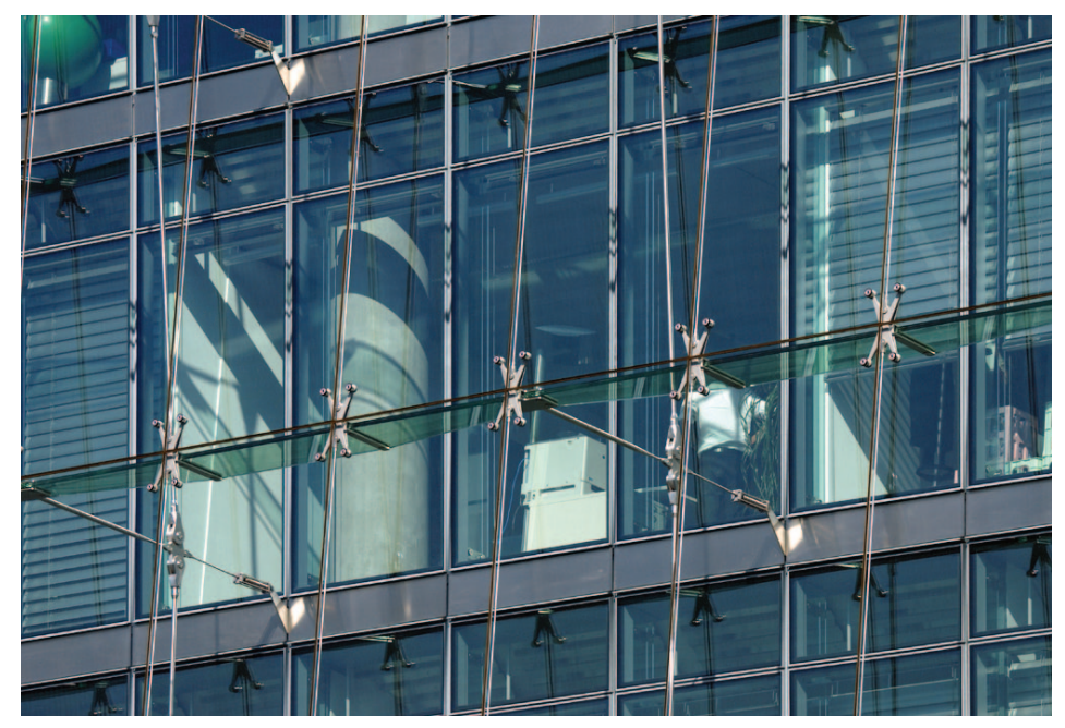
Fig. 5. Sony Center, arch. Murphy & Jahn Architects, 2000

Il. 5. Sony Center, proj. Murphy & Jahn Architects, 2000