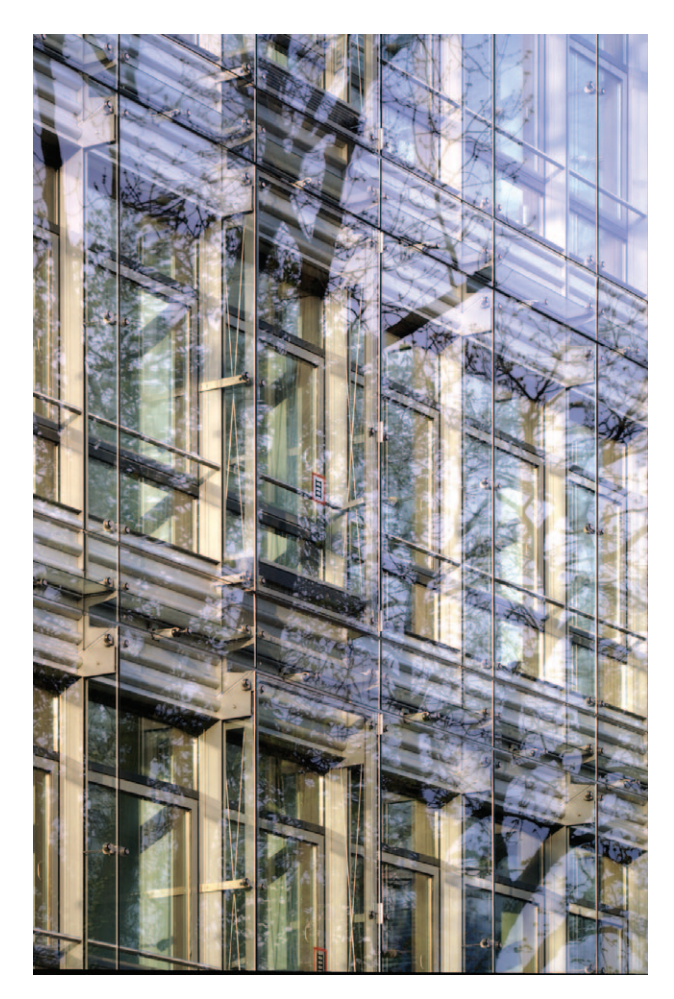
Fig. 1. Office building at Bockenheimer Landstrasse, arch. KSP Architekten, 1998

A summary effect will result from the imposition of the multiple light fluxes from both sides of each pane. This multiplication can lead to a total loss of transparency. Double façades even if clear, produce enough reflection to function as a screen [11, p. 10]. A clear example of this visual multiplication is an office building at Bockenheimer Landstrasse in Frankfurt. In this case the outer leaf of the double façade is made of single panes of glass that are point mounted by specially shaped brackets. The upper bracket bears the whole weight of the pane, the other two function only as fixing spacers (do not bear vertical loads of the pane). System of glass mounting is made of filigree bars and rods. Lack of clearly visible structural elements attract the observer's visual attention to the virtual image formed in a façade. Multiplied reflections of surrounding buildings make the load-bearing structure of glass even less visible. This phenomenon intensifies the effect of the façade's "suspension" [1, p. 38]. Virtual images are formed on every smooth-transparent plane. Superimposing multiplied reflections of tree