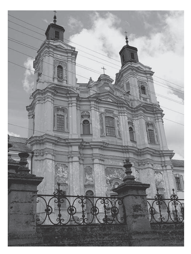
Fig. 3. Jesuit monastery in Kremenets. St. Ignacio Church

Their main task is to conduct scientific inventory of monuments in the provinces entrusted to them. I would like to point out that the Lublin district, which should interest us primarily consists of Lublin, Polissia and Volyn