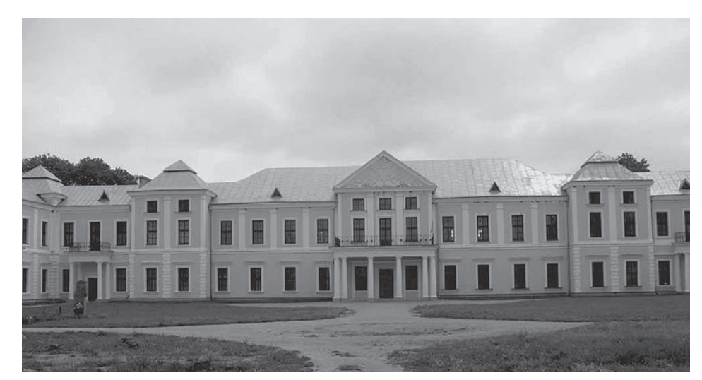
Fig. 4. Palace in Vyshnivets. Overall view from the courtyard