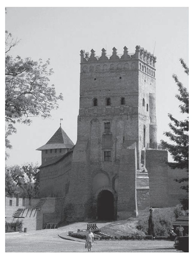
Fig. 5. Lubart Castle in Lutsk. Gate Tower

A special place among the local monuments which were restored in Volyn was occupied by Lubart castle in Lutsk. Back in 1922, a special commission consisting of representatives of local authorities invited from Warsaw and local experts was set up and it worked on the problem of urgent steps to strengthen the castle. Previous studies were based on materials inventory of 1910–1912, made during the expedition led by a renowned architect K. Ivanitskiy of the Imperial Archaeological Commission (measure drawings and photographs) [1, pp. 44, 75]. The state of emergency of solid defence building was twice