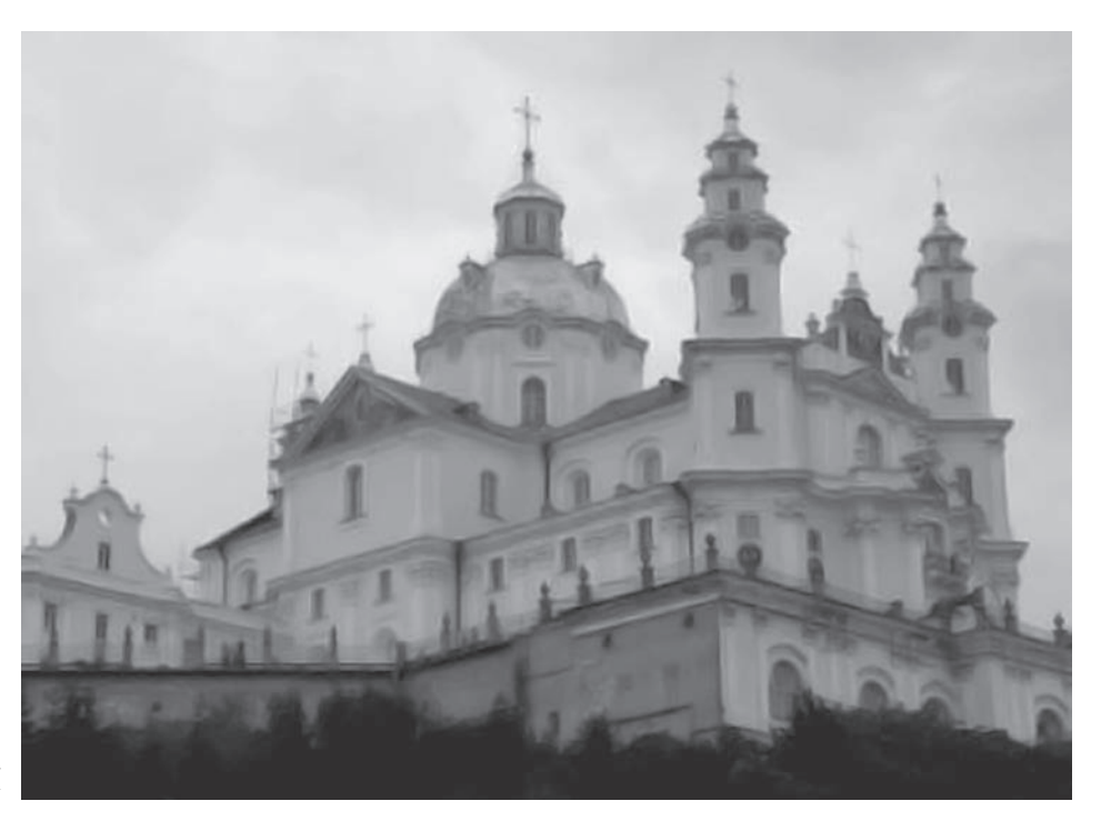
Fig. 1. St. Uspenska Lavra in Pochaiv. Overall view

Attitudes to the historical and architectural heritage of the state situated in its territory determine not only the general level of culture, but also a considerable degree of self-awareness of a group of people as a community which is united by the historical background, spiritual and material heritage, requiring constant care and promotion. We know that at this stage of the development of the world civilization, this problem is especially acute in two cases: mainly in the period of strengthening of the state as an independent political union and globalization