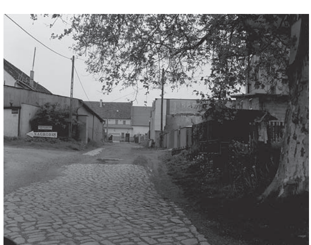
Figs. 3-6. Village central square in Tyńczyk Legnicki, Krotoszyce, Kozice, Złotniki

Residential preference surveys of Krotoszyce's residents were compiled by the authors of this article in spring 2010 – these surveys were aimed at finding out which points are important for the residents of the municipality and its individual localities<sup>1</sup>. They were formed as part of a study of conditions and directions of municipality's land development. The questions pertained not only to the pros