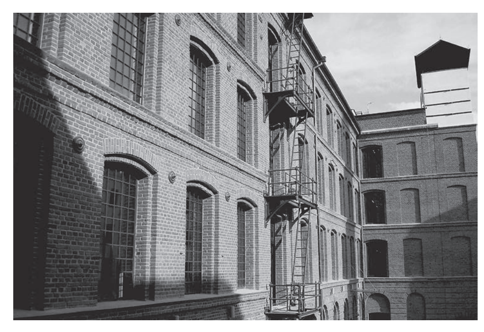
Fig. 4. Eastern building and dust tower from the side of the inner yard direction

for weavers and clothiers (19th century), a summer villa (beginnings of the 20th century), a church (former Protestant church) and a tram stop (beginnings of the 20th century). This complex, which was created by us, constitutes the first in Poland open-air museum of urban architecture. Wooden buildings were dismantled, restored and then put together again on the territory of the open-air museum; the original appearance and facades colours as well as the arrangement of rooms were restored (which dispelled a myth that the 19th-century Łódź was grey and dirty). The objects in the open-air museum are not only exhibits but they are adapted to fulfil different functions; they create a space which is live and attractive for the visitors. St. Andrew Bobola Church was consecrated once again and wedding ceremonies already take place there. The complement of the open-air museum development con-