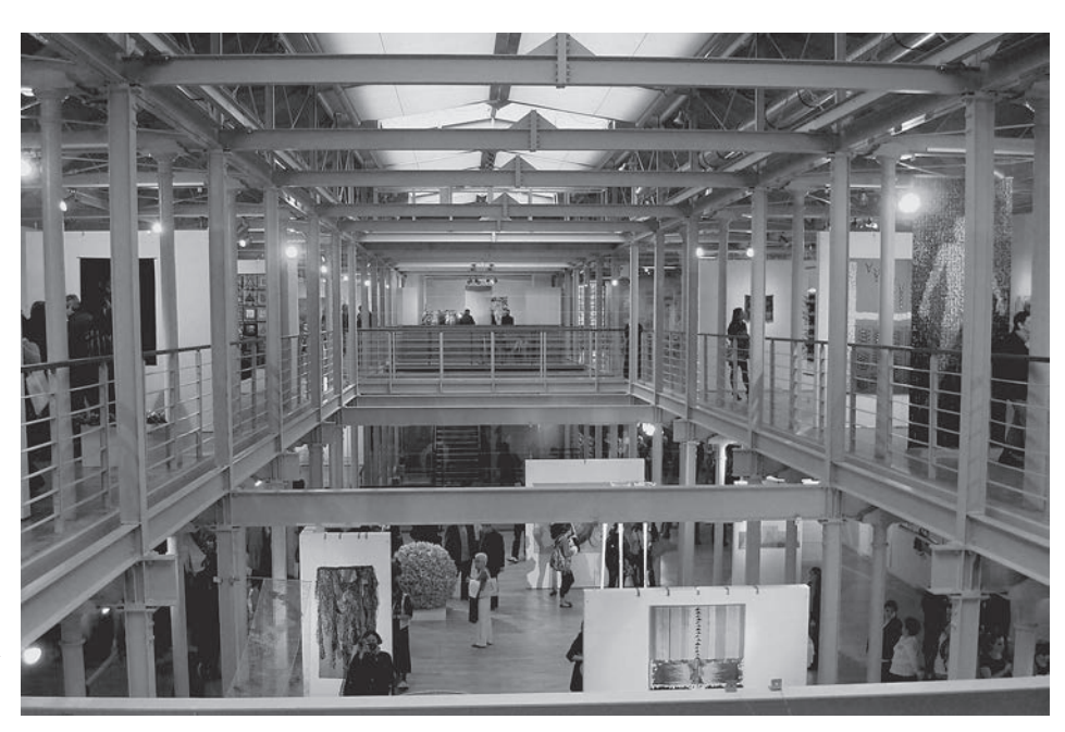
Fig. 5. Two-storey exhibition hall in the eastern wing; Triennial of Fabric 2010

stitutes a revitalized former big factory bath house where a museum coffee shop is supposed to be situated; the area was enriched with the exhibition of historical technical devices and elements of small architecture creating in this way picturesque places which became photographic locations willingly visited by people.