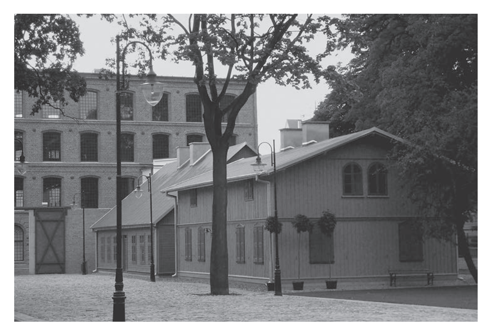
Fig. 3. Open-air Museum of Łódź Wooden Architecture

with the Open-air Museum. Thanks to the new space organization, the open-air museum became an integral part of the museum – the first 'exhibit' which a visitor can admire.