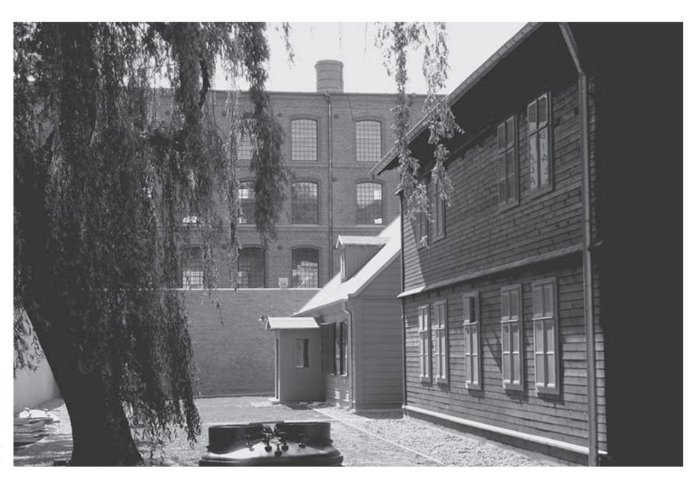
Fig. 2. Open-air Museum of Łódź Wooden Architecture

In the oldest buildings of the spinning mill and Geyer weaving factory a new city institution was created in the 1950s – the Weaving Department of the Museum of Art. The location of the cultural institution on the territory of the unique factory complex, which had unusual historical and artistic values, was symbolic and gave an opportunity for favourable functioning and perspective development of the museum. Reconstruction of buildings in the early post-war years resulted in the fact that the museum in a way became a pioneer in adapting industrial structures for exhibition functions – the process of rebuilding the western wing was probably the first in Poland and doubtless one of the first post-industrial architecture reconstructions for museum purposes in the world.