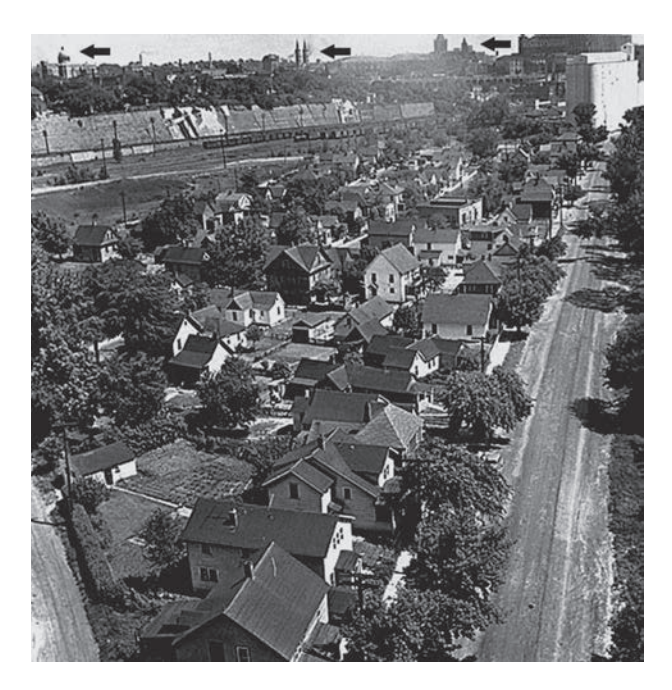
Fig. 2. "Little Italy 1925".