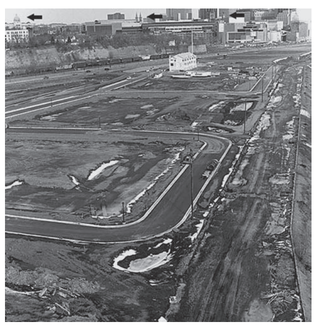
Fig. 3. "Upper Landing 2003".