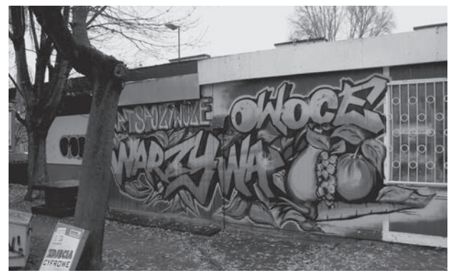
Fig 14. The back elevation of the service centre on the 'Tatary' Housing Estate. Graffiti made by the young residents of the estate