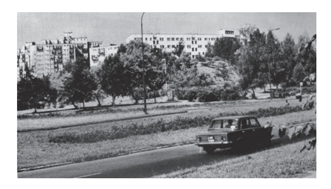
Fig .6. Słowacki Estate in the 1980s4 [8]

It was built as the second estate within the framework of the Lublin Housing Cooperative. The authors of the design were Zofia and Oskar Hansen [1]. The estate was built in the years 1964–1970 according to the concept of 'Open Form', which was elaborated by Oskar Hansen<sup>5</sup> [2].