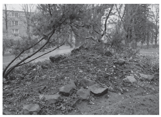
Fig. 5. Remains of the rock gardens on the Mickiewicz Estate