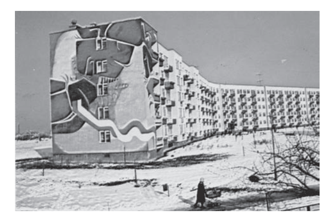
Fig. 11. The painting composition (it does not exist now) on the gable of the building on the Krasiński Estate. Source: Gnot L., Nowy Lublin, Osiedla LSM, Wojewódzki Ośrodek Informacji Turystycznej w Lublinie, Lublin 1977

well as architects from all over Poland and students of fine arts academies took part in this meeting. The goal of these meetings was the integration of graphic arts within the urban environment. As a result, a number of sculptural works were realized as well as paintings and mosaics on gables and in entrance areas of buildings. Before they were completed, these works were discussed with the residents of the LSM estates and then presented at numerous exhibitions and meetings in the artistic circles. These works added splendour to various places within the estates for almost fifty years. Now, most of these paintings and mosaics are destroyed due to insulation works carried out on the residential building and restoration of the public utility buildings. The only ones which are preserved until today are the mosaics in the passages between buildings on the Juliusz Słowacki Estate (Fig. 10).