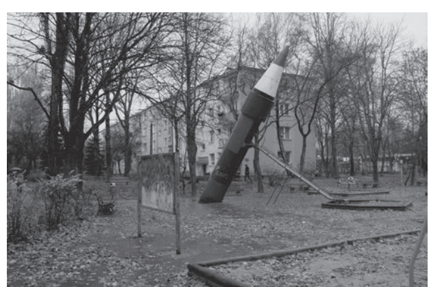
Fig. 4. Playground on the Mickiewicz Estate in the 1980s and today. Photo by E. Przesmycka, 2010<sup>3</sup>

The first housing estate to be built within the framework of the Lublin Housing Cooperative was Adam Mickiewicz Estate<sup>2</sup>. At the same time, social and technical infrastructure was created, including shopping and service centres, outpatient clinics, schools, kindergartens, social clubs and libraries [3, 4, 11].