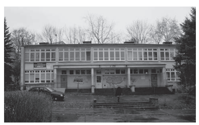
Fig. 13. LSM estate shopping centres.