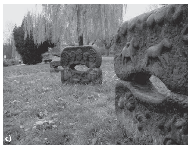
Fig. 8. Piastowskie Estate, central square in the 1980s<sup>7</sup> (a) and today with the preserved sandstone sculptures, photo by E. Przesmycka, 2010 (b, c)

Design works on the Piastowskie Estate started in 1966 and the building process commenced one year later. In this estate, some ready-made architectonic projects of residential buildings were used<sup>6</sup>. Similarly to the previous estates, a very important role was played by green areas and the rich program of associated infrastructure.