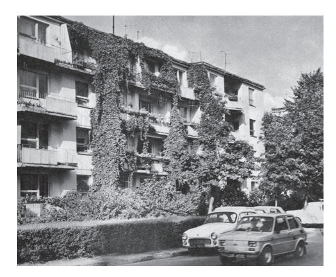
Fig. 2. The Mickiewicz Estate in the 1980s [5]