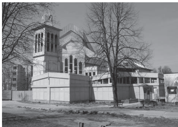
Fig. 12. Shopping centres designed by Oskar Hansen on the Słowacki Housing Estate, LSM Cooperative in Lublin

The estate spaces were complemented by numerous shopping and service centres, social clubs, kindergartens, nurseries, passages and market squares. Amphitheatres, sleighing hills as well as other forms of small architecture were constructed on some estates. While carrying out such realizations, architects had a chance to demonstrate their professional skills as they were not forced to design buildings with the use of the large concrete slab technologies. These small complexes and separate buildings often situated in the central parts of the estates presented a high level of architectural culture.