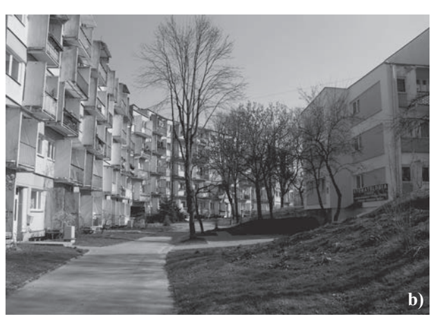
Fig. 7. Band type buildings of Słowacki Estate, photo by M. Sosnowska, 2007 (a). The state from 2007, photo by E. Przesmycka, 2010 (b)

plex. The basis of the estate composition constituted three long, segmented, five-storey residential buildings (Fig. 7). Perpendicular to them, there are three shorter five-storey buildings. The entire complex opens up to the south where there are recreation areas of the estate. These buildings are completed by eleven-story buildings. The social and technical infrastructure was created at the same time as the residential buildings. With reference to the idea of the Linear Continuous System, the estate system is divided into bands: serviced zone – flats, northern servicing zone – vehicular traffic, southern servicing zone – recreation,