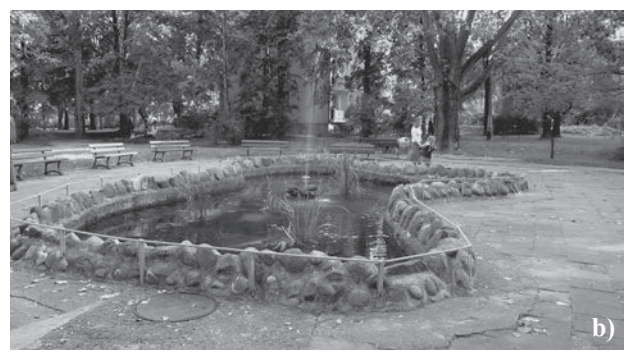
Fig. 3. Fountain on the Mickiewicz Estate in the 1980s (a). The same fountain in 2008, photo by M. Sosnowska, 2008 (b)