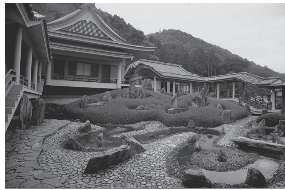
Fig. 5. The shape of Mt. Matsuo behind the shrine is "borrowed" into the garden by a reproduced hill with clipped karikomi shrubs. The banks of the meandering stream are covered with flat, bluish rocks and its shallow bottom is covered with small pebbles

rich Japanese repertoire of traditional techniques. As a result the gardens are still close to their roots.