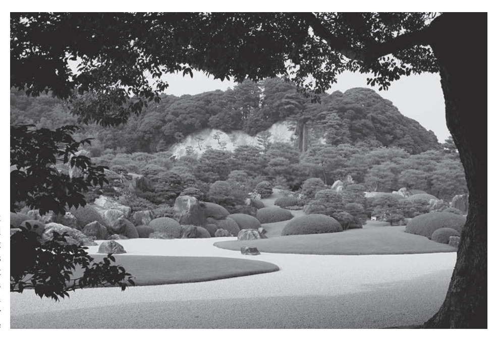
Fig. 3. The tree trunk and branches in the foreground catch a glimpse of the distant view. Space in the garden thus appears to be bigger than it really is. When garden borders are not visible, focusing on a part enables the viewer to imagine the whole