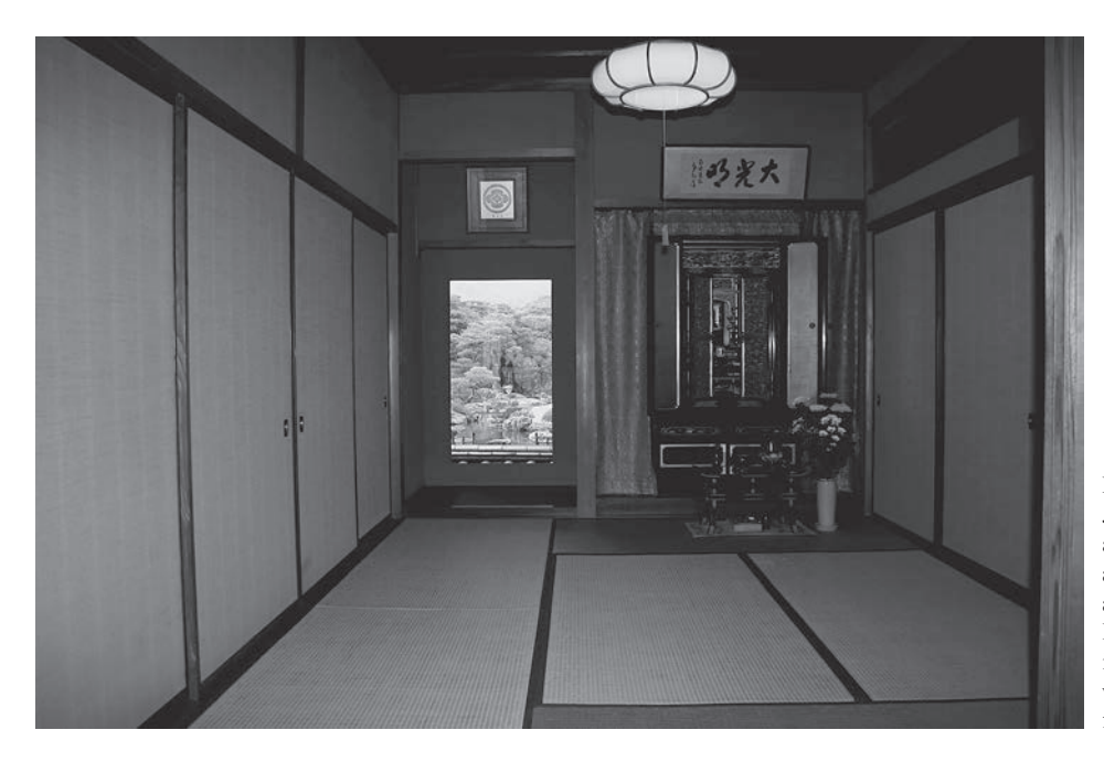
Fig. 4. In the traditional Japanese room there may be a tokonoma alcove with a flower arrangement and/or hanging scroll painting. In this room, the scroll is imaginatively replaced with an actual view, a cropped fragment of the garden

beauty can be shown in artistic work by simplicity and delicate suggestion of color, form or texture. The characteristic features of traditional homes include almost empty interior, simplicity, harmoniousness and beauty of few details. The mind and ingeniousness of the viewer should complement the image which is visible only for a short moment. The external emptiness is internally rich. Emptiness - which is erroneously identified with nothingness - is a treasure chest full of infinite possibilities. This idea is the "essence" of the Japanese home and garden. The most important thing is the space designed with basis elements – it is the "pure" function. Contemporary buildings and gardens are designed in Japan according to the above assumptions and their value is demonstrated not in their rich ornaments but in the sophisticated details made of traditional materials or in compliance with the traditional spatial form (Fig. 4).