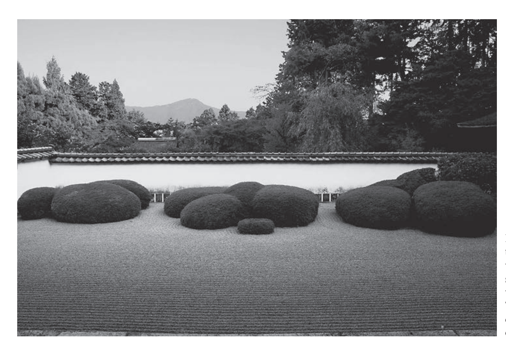
Fig. 1. In this karesansui garden, the stones are replaced with clipped azaleas and camellia shrubs. There are three groups with three, five, and seven plants. The shakkei technique of a borrowed distant view is of Mt. Hiei