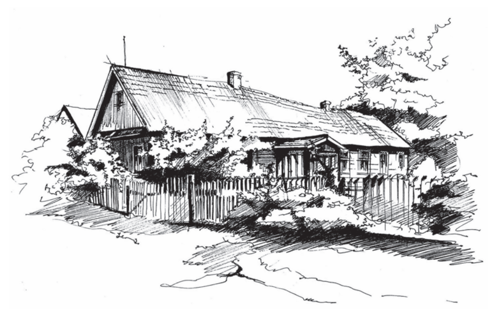
Fig. 1. Free-hand sketch of surveyed and mapped building, by Monika Maksimowicz