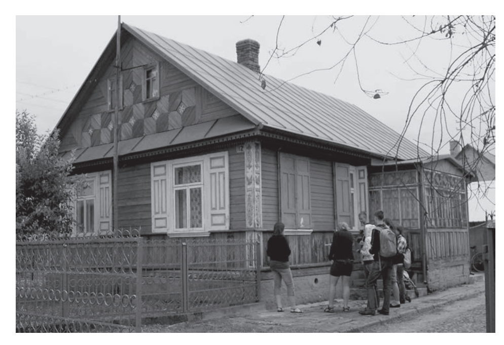
Fig. 4. Group patron's explanation concerning the precision of measurements.

the participants under supervision of professionals took pictures of landscape and architecture, individual buildings and decorative details from proper perspective.