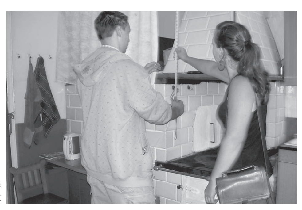
Fig. 6. Measurement of the kitchen stove, Czyże village.

measurements with the use of a tape measure and gave readings to be included in the drawings. The field sketches are an indispensable element of collecting data, and the participants were encouraged to make them. The explanations of the principles of the perspective, presentation of free-hand sketches (Fig. 1), drawing techniques, methods of application of different techniques and drawing instruments: pencil, pen and ink, charcoal proved helpful. The students were willing to present their own drawing skills and attentively listened to professional advice.