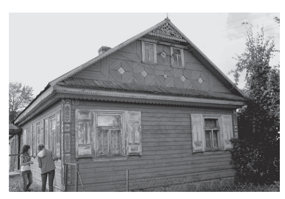
Fig. 5. Measurement of corner decorations of residential building, Czyże village.

While doing that they used the questionnaire prepared by the workshop organizer in which the most important issues were listed e.g. general data such as the name and address of the building, including their name in local dialect, date of construction, history of erection, builder and owner as well as a sketch of location of the building in the homestead, names of individual rooms, building and finishing materials, description of decorative details, information about tools and furniture. The data regarding renovations, modernizations altering the original shape were also important. Other persons were responsible for taking pictures of buildings, interiors, furniture as well as details. Still others were making an inventory note, detailing a sketch of the layout of the rooms in the building with their names, a drawing of elevations and a drawing of decorative details. Three other persons were taking