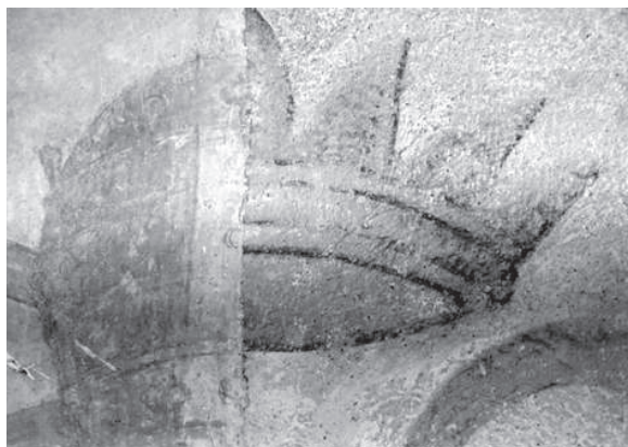
Fig. 8. Holszany, originally a crown was painted under the cartouche and then a pope's tiara and keys of St. Peter appeared in two successive layers

Il. 7. Holszany, znaki zachowane na tle różowej chmury stanowią interesującą zagadkę dla badaczy. Możliwe, że jest to forma sygnatury i data (?)