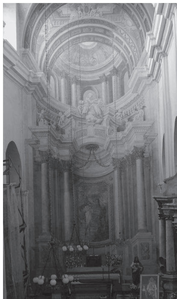
Fig. 10. Holszany, painting after conservation

The painting in the church in Holszany, despite being surely the nicest, is just a small part of the conservation works. The preliminary plan of restoration of the original polychrome on the marble altars was developed; conservation of a part of one of them was the subject of a master's thesis 16 . It will be necessary to clean the remains of oil