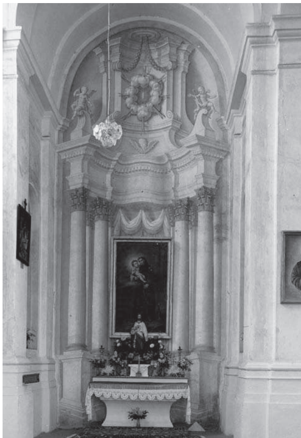
Fig. 3. Side altar of St. Anthony in the church of Friars Minor in Budslaw

um employees saved the marble tomb monument of the founder of the Franciscan estates in Holszany – Paweł Stefan Sapięha and his two wives (Regina and Elżbieta) from total destruction. It was moved to the Museum of Early Belarusian Culture in Minsk. What remained of