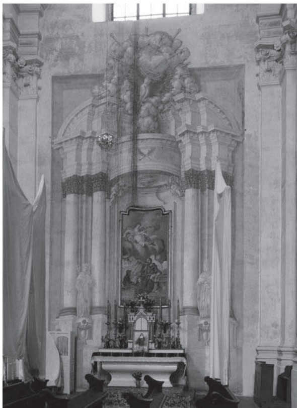
Fig. 4. Side altar of St. Francis in the church of Friars Minor in Budslaw (photo: G. Trimakas, 1977)

Il. 4. Boczny ołtarz św. Franciszka w kościele bernardyńskim w Budslawiu (fot. G. Trimakas, 1977)