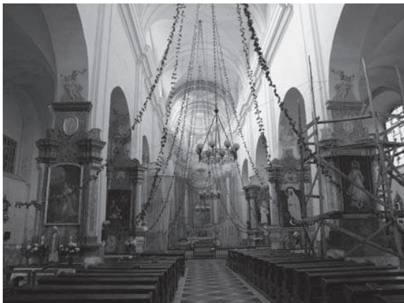
Fig. 2. Holszany interior of the church with side altars

Il. 2. Holszany, widok wnętrza kościoła z perspektywą ołtarzy bocznych