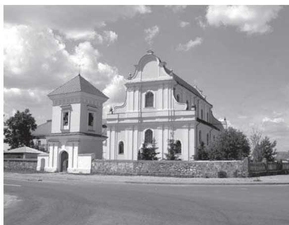
Fig. 1. Church in Holszany

In the 1930s, the Soviet authorities closed the church in Holszany and turned it, just like many other churches, into workshops. It was given back to the believers only in 1990, and at the very end of the 20 th century, the Franciscan monks returned there too. However, they found the temple, which once was famous for its excellent pieces of sacred art, destroyed and devastated. There were no altar paintings, wooden pews, confessionals, Rococo ornaments, carved in wood figures of four Evangelists and St. John the Baptist that once decorated the pulpit, or the pulpit itself, which was earlier located by the side altar of St. Anthony. The wooden elements of its interior decoration were probably burned down by the workshop workers. The Belarusian muse-