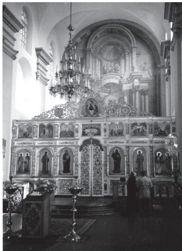
Fig. 5. Interior of the monastic orthodox church of the Basilians (currently eastern orthodox), Liady. Behind the iconostasis on the sanctuary wall, the upper section of painted altar (photo: D. Klajumienė, 2000)

Il. 5. Wnętrze cerkwi klasztornej bazylianów (teraz prawosławnych), Liady. Za ikonostasem na ścianie prezbiterium widoczna górna część namalowanego ołtarza (fot. D. Klajumienė, 2000)