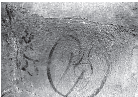
Fig. 7. Holszany, original signs with a pink cloud in the background pose an interesting riddle for researchers. It is possible that it is a form of signature and date (?)

Il. 7. Holszany, znaki zachowane na tle różowej chmury stanowią interesującą zagadkę dla badaczy. Możliwe, że jest to forma sygnatury i data (?)