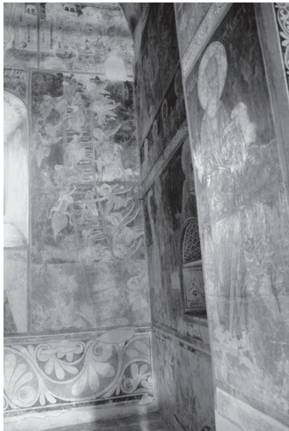
Fig. 3. Montenegro, Pivski Monastery, fresco with the ladder of virtues on the north wall of the narthex

Il. 3. Czarnogóra, Pivski Monastery, fresk przedstawiający drabinę cnót na północnej ścianie narteksu