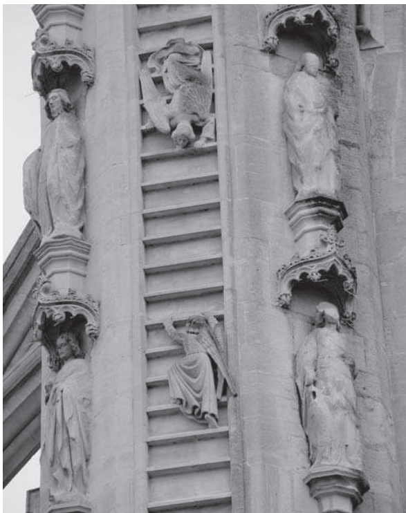
Fig. 2. Cathedral in Bath, west front, fragment of the ladder of virtues on the north side

Il. 2. Katedra w Bath, elewacja zachodnia, fragment drabiny cnót po stronie północnej