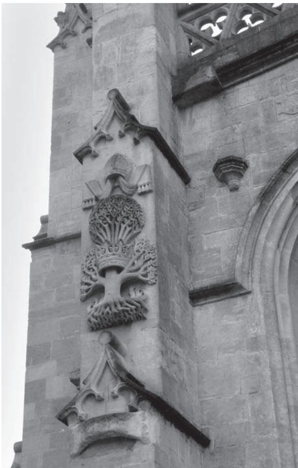
Fig. 6. Cathedral in Bath, west front, relief symbolizing Bishop Oliver King (photo: Z. Świechowski, 2009)

Il. 6. Katedra w Bath, elewacja zachodnia, relief symbolizujący bp. Oliviera Kinga (fot. Z. Świechowski, 2009)