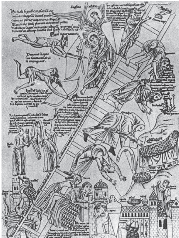
Fig. 4. The ladder of virtues in Hortus Deliciarum by Herrad of Landsberg, 2nd half of the 12 th century

Il. 4. Drabina cnót w kodeksie Hortus Deliciarum Herrady z Landsbergu, 2 poł. XII w.