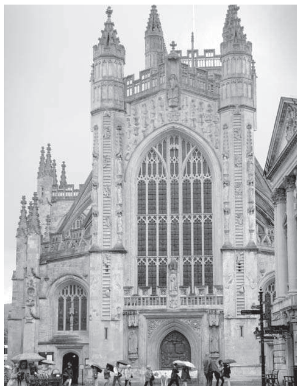
Fig. 1. Cathedral in Bath, west front

Il. 1. Katedra w Bath, elewacja zachodnia