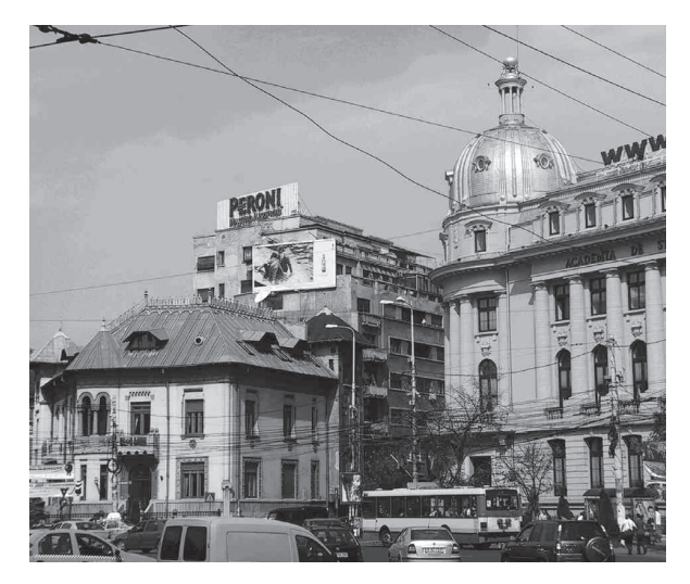
Fig. 1. Neo-Romanian style, modernism and eclecticism in architecture of Piața Romăna