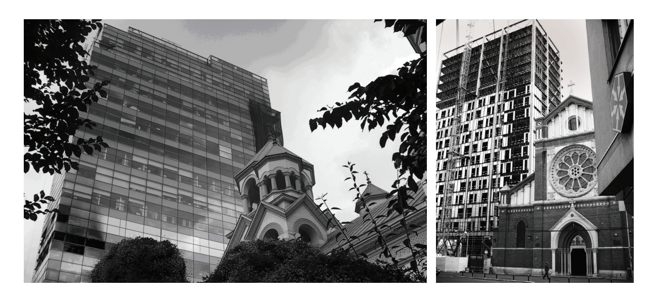
Fig. 15. Controversial investments by the Catholic Cathedral and Armenian Church II. 15. Kontrowersyjne inwestycje przy Katedrze Katolickiej i Kościele Ormiańskim

Romania adopted the market economy. The People's House – currently the Palace of the Parliament – became tourist attraction and former commodity warehouses were