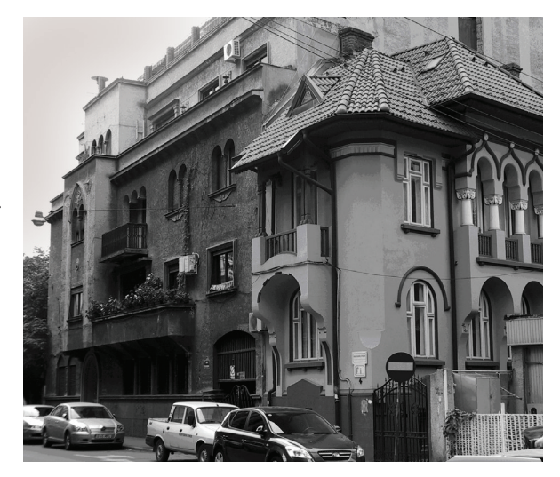
Fig. 5. In the foreground, Neo-Romanian city house; in the background, modern building with details inspired by indigenous style

The indigenous style has numerous variations which vary depending on the moment of origin and the architect's ingenuity. Apart from academic examples of the Neo-Romanian school, the indigenous elements were introduced selectively into eclectic architecture and even modern designs from the 1930s (Fig. 5).