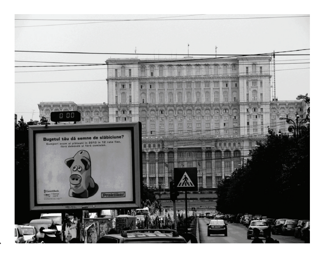
Fig. 12. The Palace of the Parliament (former People's House) at the closing of the viewing axis

The schematic and monumental architecture of these buildings is a combination of socialist realism, a sort of Ricardo Bofill's European post-modernism and the style of official building in North Korea, with which the dictator maintained close relations (Fig. 13).