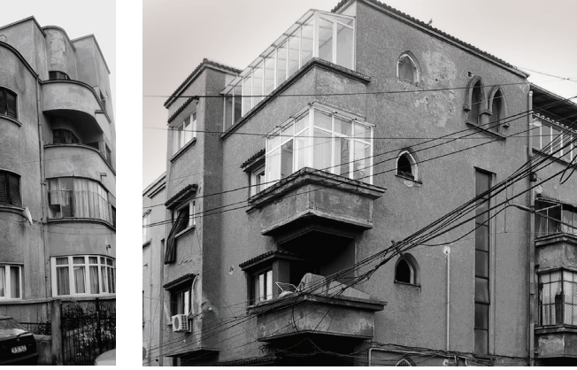
Il. 11. Modernistyczna bryła i historyzujący detal