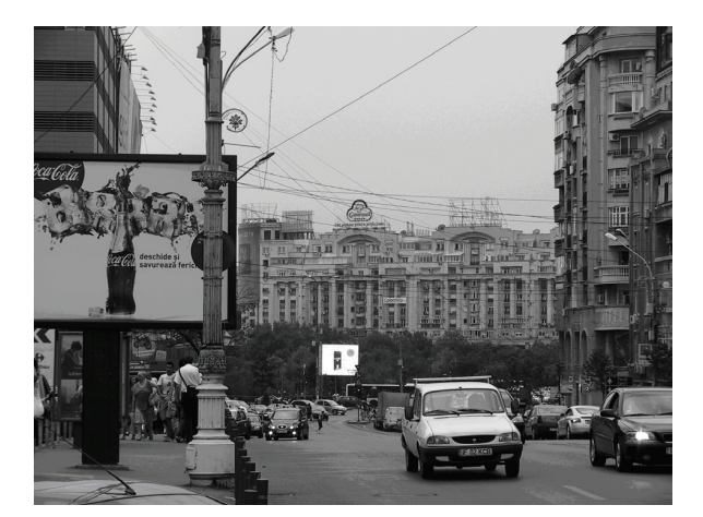
Fig. 13. View of former "Socialist City" Il. 13. Widok dawnego "Miasta Socjalistycznego"

Ceauşescu's activities resulted in irreversible changes in the face of Bucharest. The diverse historic landscape of the city was replaced with a monotonous and oversized urban design. The only remains of the destroyed district are its historic orthodox churches and monasteries which for ideological reasons were blocked by new buildings or hidden inside the quarters (Fig. 14).