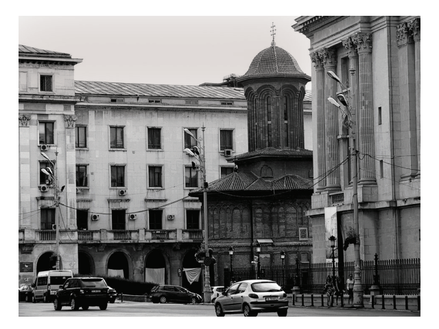
Fig. 3. Kretzulescu Orthodox Church (1720–1722) in the Revolution Square

At the beginning of the 20<sup>th</sup> century, after a period of uncritical fascination with the Western European patterns, these buildings inspired the architects who wished to express the national ideas (Fig. 4). One of the most prominent repre-