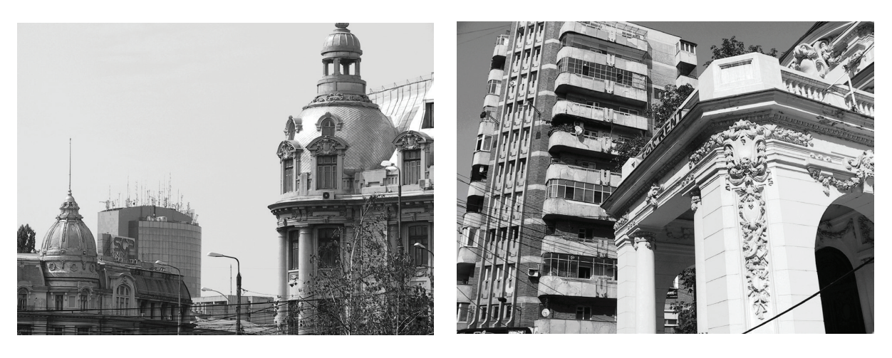
Fig. 6. Eclectic architecture of Piața Universității II. 6. Eklektyczna zabudowa Piața Universității

Over the last two decades of the 19th century, a number of representative buildings of public utility and government administration were erected in the area of the