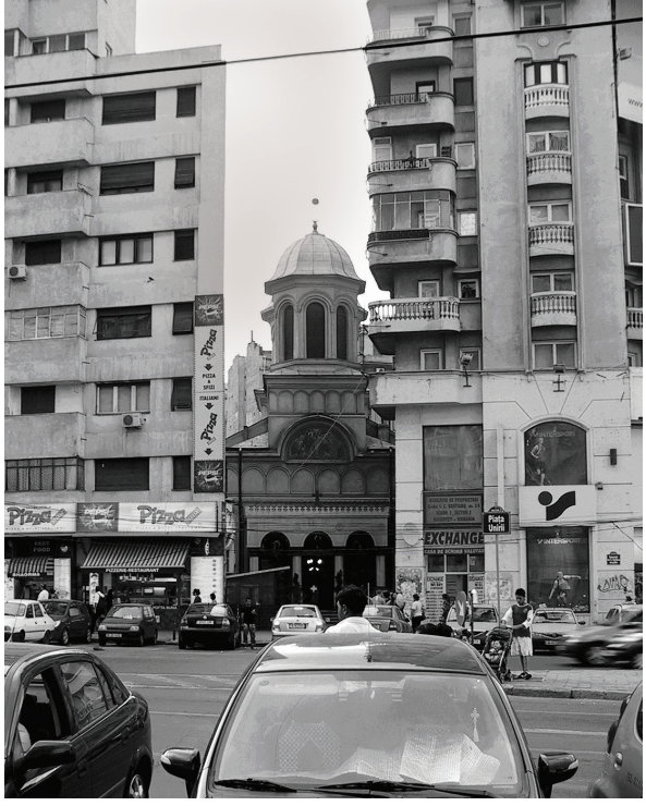
Fig. 14. Historic Orthodox Church hidden among socialist architecture around Piata Unirii

Ceauşescu's activities resulted in irreversible changes in the face of Bucharest. The diverse historic landscape of the city was replaced with a monotonous and oversized urban design. The only remains of the destroyed district are its historic orthodox churches and monasteries which for ideological reasons were blocked by new buildings or hidden inside the quarters (Fig. 14).