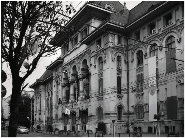
Fig. 4. Town Hall in Bucharest (1906–1910) designed in the Neo-Romanian style by Petre Antonescu

II. 4. Ratusz w Bukareszcie (1906–1910), zaprojektowany w stylu neorumuńskim przez arch. Petre Antonescu