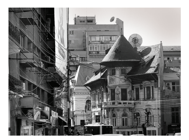
Fig. 2. Diversified architecture of Bucharest center II. 2. Zróżnicowana zabudowa śródmieścia Bukaresztu

of architectural forms resemble the spirit of the Levantine cities (Fig. 2). The specific natural features of the city also affect its special landscape. An increased seismic activity of that area results in a faster technical degradation of the city structures. The buildings which were damaged, or the ones which did not meet the growing needs, were replaced with bigger or more imposing ones – erected in line with currently fashionable stylistic conventions.