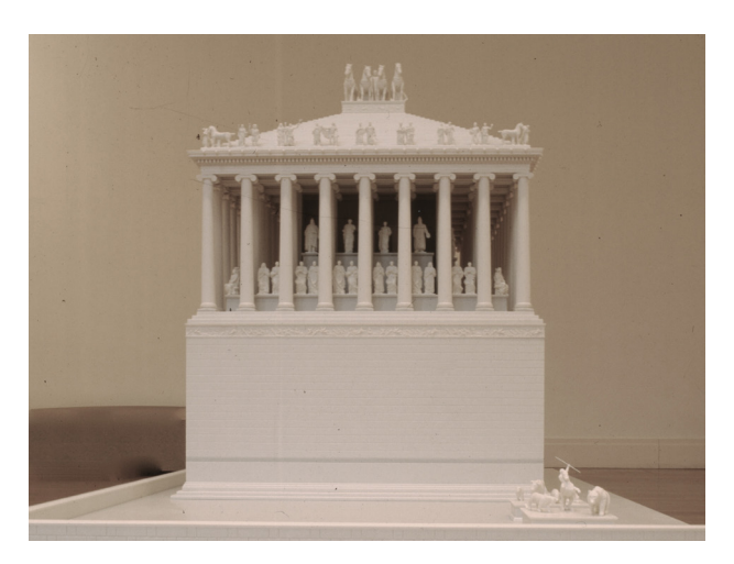
Fig. 3. Model of the Mausoleum of Halikarnassos, how described by ancient writers

II. 3. Model Mauzoleum w Halikarnasie według opisu starożytnych pisarzy