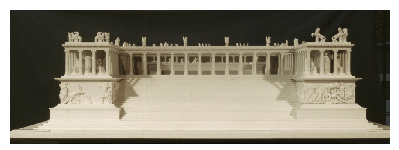
Fig. 1. Model of the Pergamon Altar, here the east side where Zeus an Athena struggled with Titans

II. 1. Model Ołtarza Pergamońskiego, strona wschodnia, gdzie Zeus i Atena zmagają się z Tytanami