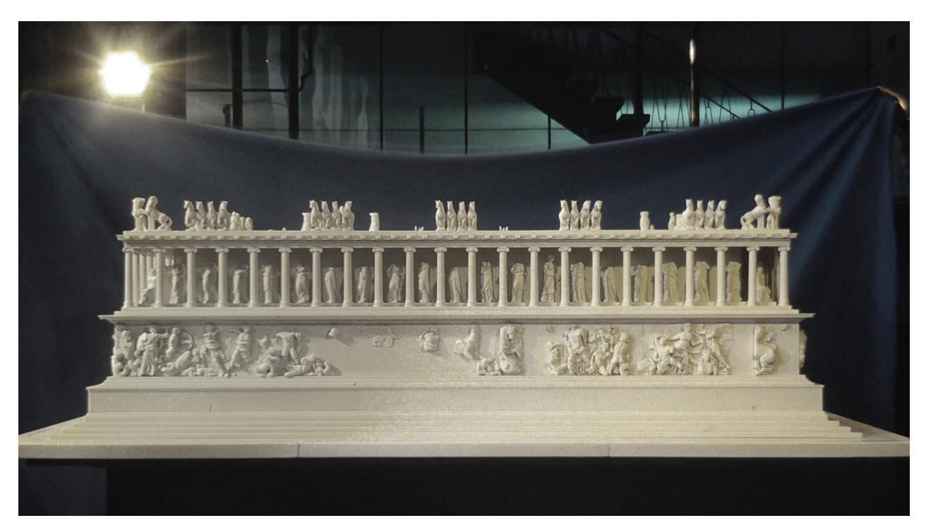
Fig. 2. Model of the Pergamon Altar, here the west side with the big staircase leading to the sacrifice table

II. 1. Model Ołtarza Pergamońskiego, strona wschodnia, gdzie Zeus i Atena zmagają się z Tytanami